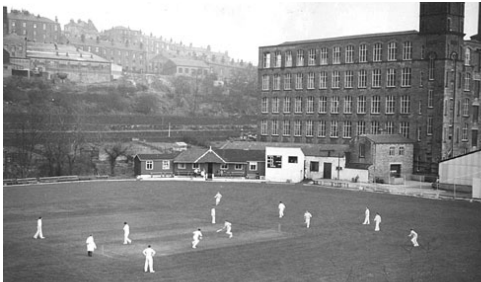
Walton Street, Sowerby Bridge in the 1950s

This exhibition is one of the many public outcomes of the Calderdale and Kirklees Cricket Heritage Project based at the University of Huddersfield. The project received a grant of £43,400 from the Heritage Lottery Fund and this was supplemented by an in-kind donation of £7,000 from the University of Huddersfield.