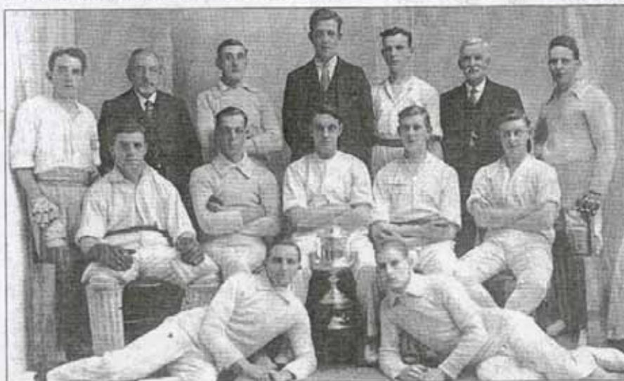
Old boys: A team picture from 1921, when the club were known as Rastrick New Road