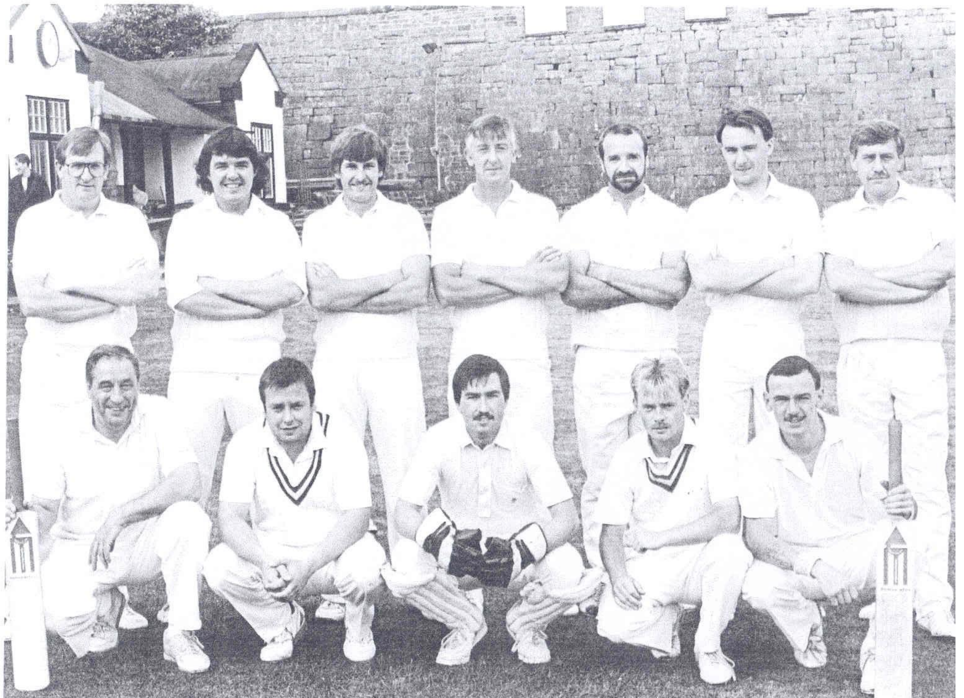
Collinson Cup Winners 1990