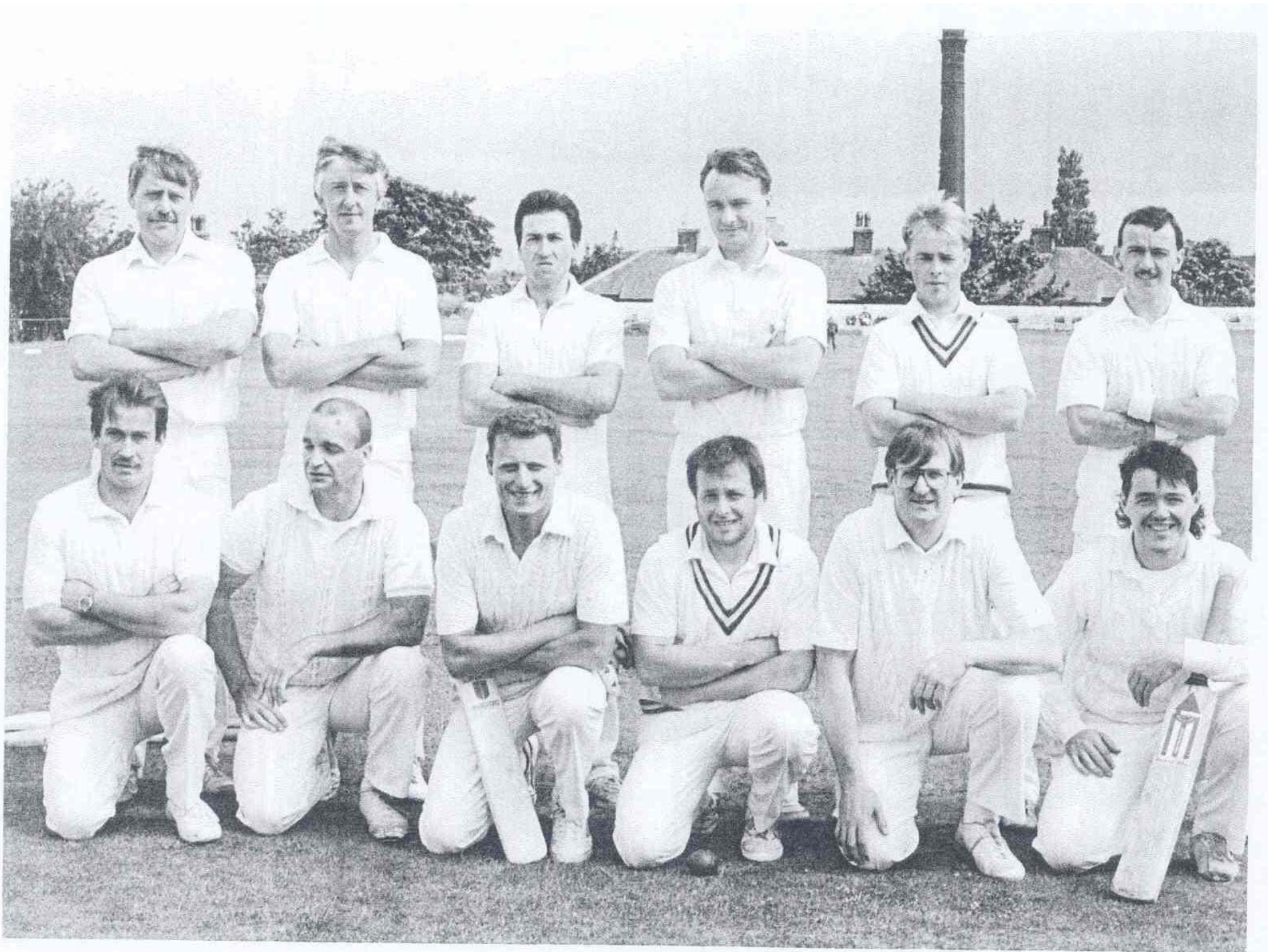
Collinson Cup Winners 1991