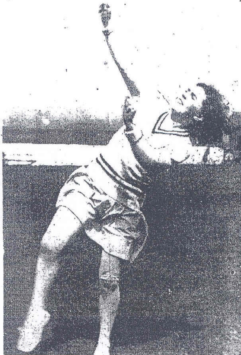
A GOOD RETURN.—A fielder in the ladies' cricket match at Rastrick, caught in graceful pose.