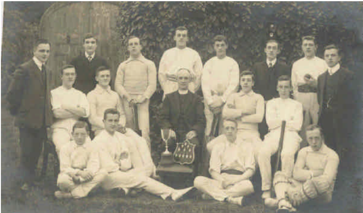
A team photograph from 1910