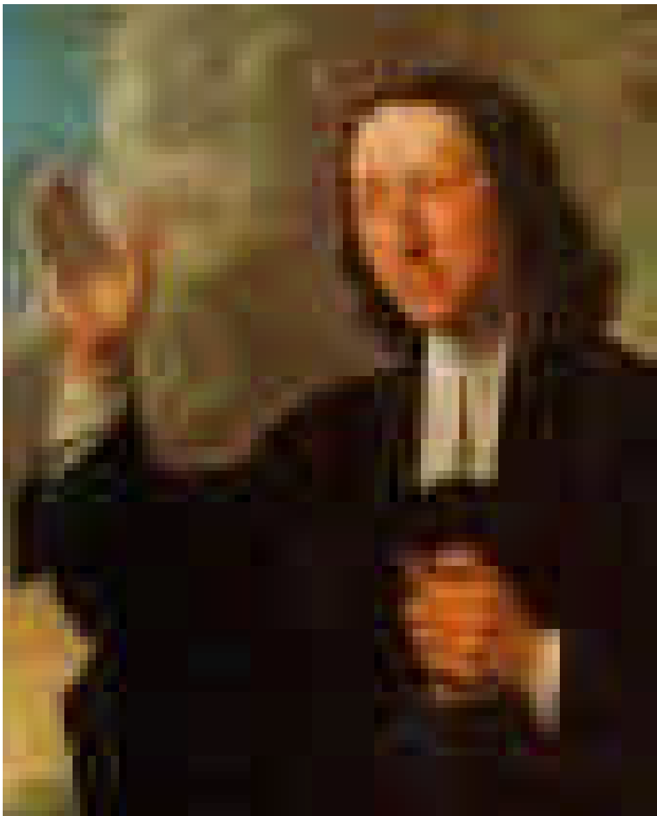
John Wesley, founder of Methodism

In the early days, the connection with the church was very strong - all the players used to be regular chapel-goers. Now, however, the link is weaker, but a lot of people from the church still come to watch and help out in the tea room.