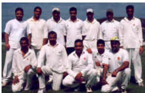
Top team Queen's Road Muslims