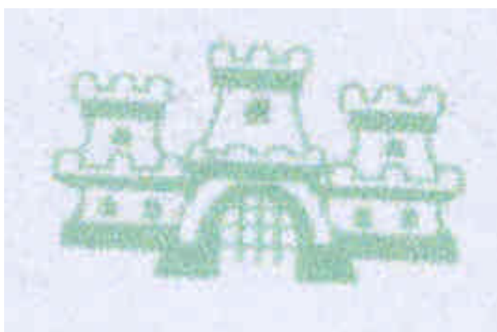
The Bradshaw C.C. crest

Northowram Methodists (later to be known as Hedge Top) played in the same league