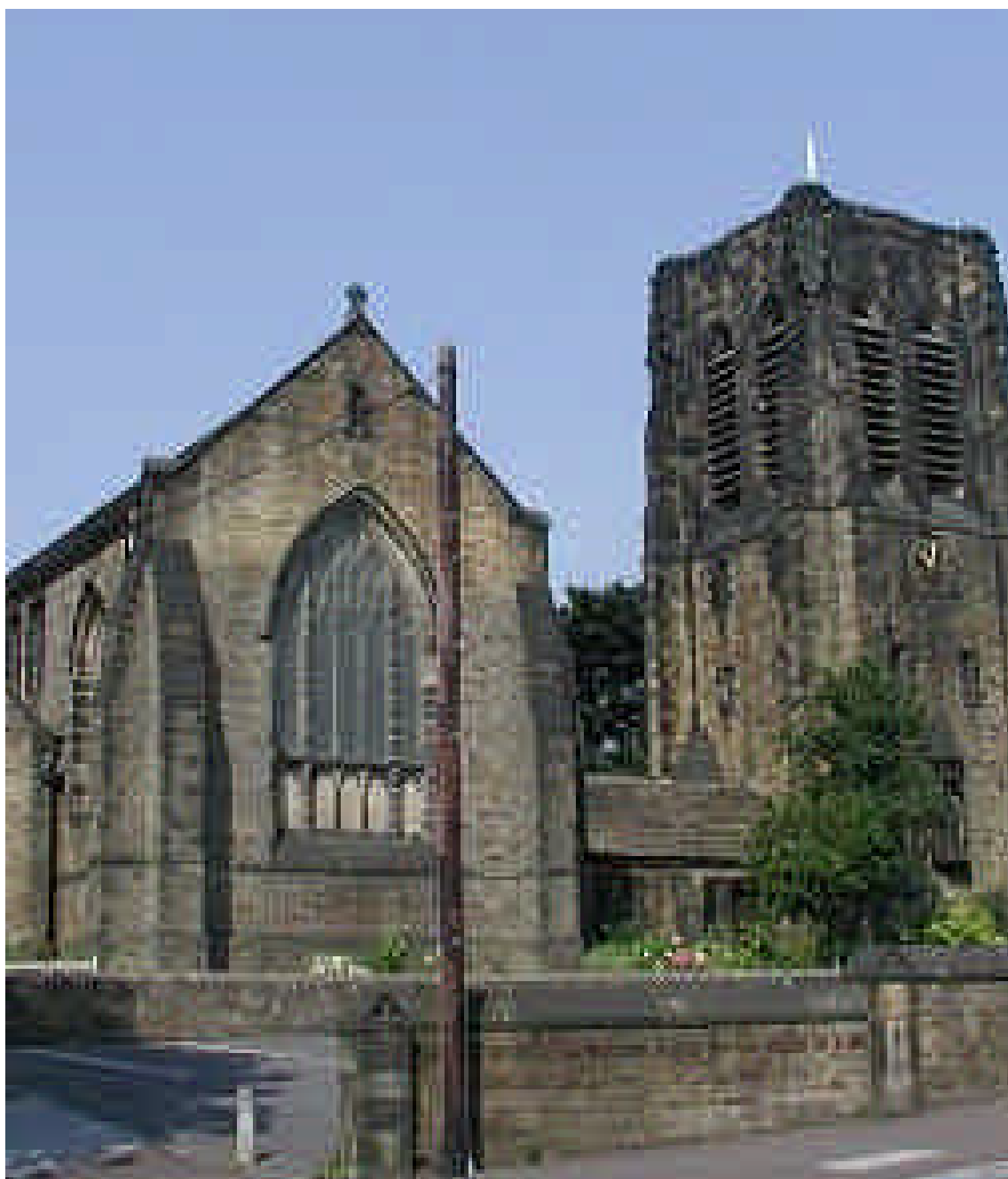
St. Matthew's