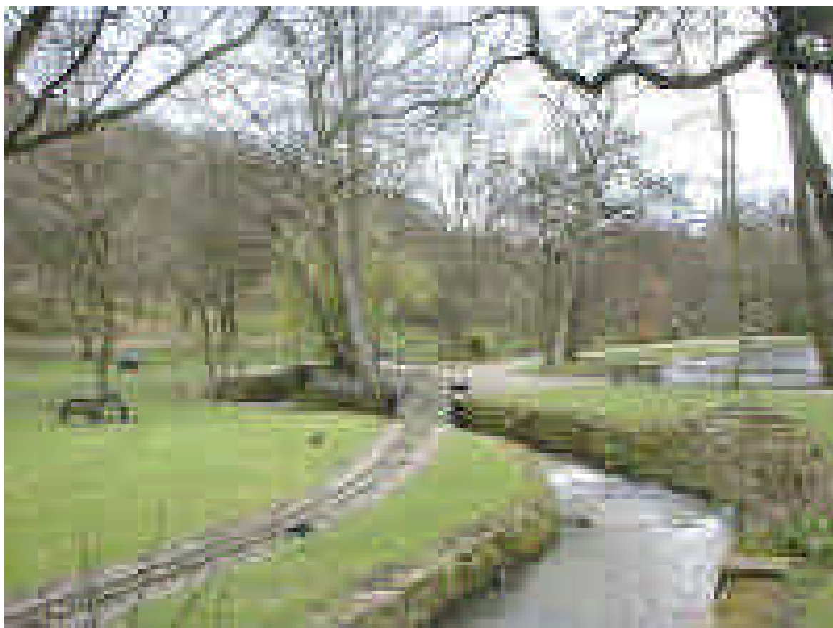
Shibden Park today

They then moved to a farmer's field at Only House Farm around 1912, then a field just above the Stocks Arms, which is now a housing estate.