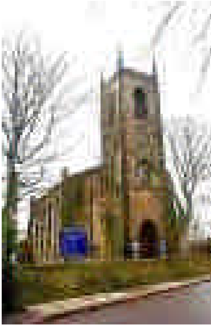
St. John's, Coley

The Heywood Church cricket field was also adjacent to the south side of Heywood Church and is now part of the Windmill housing estate.