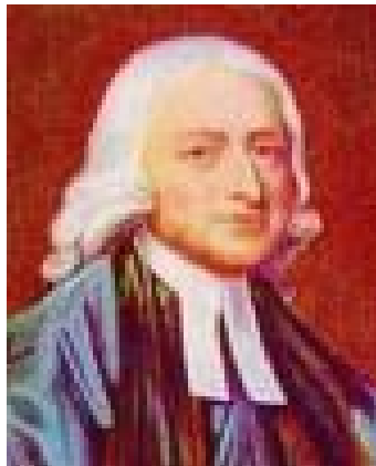
John Wesley, founder of Methodism

Northowram Hedge Top C.C. were originally known as Northowram Wesleyans C.C. – and, as the name implies, were linked to the local Methodist church.