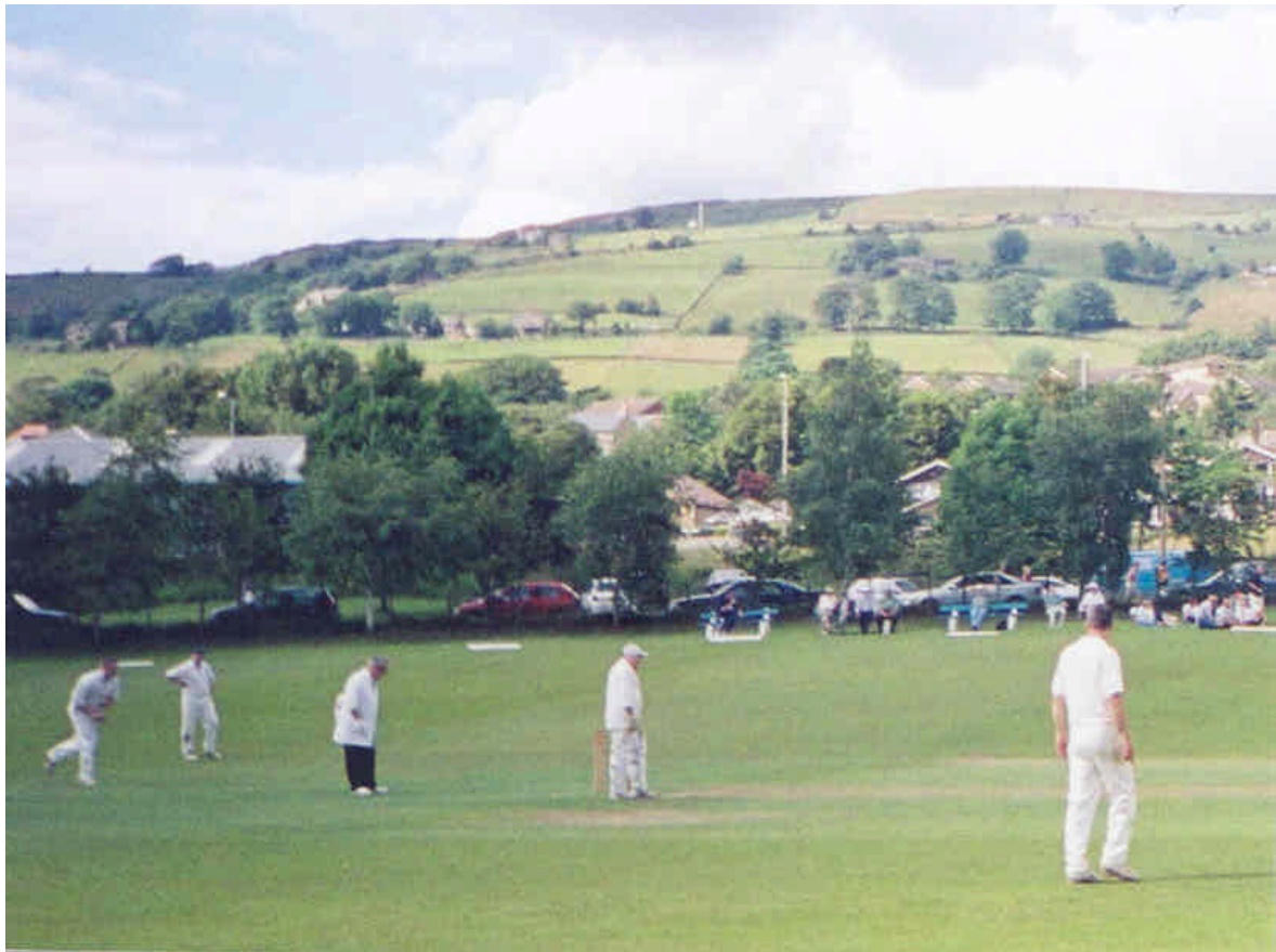
The home of 1947 League Champions, Mytholmroyd