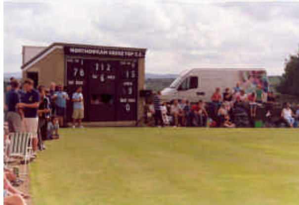
Northowram Hedge Top