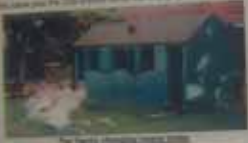
The Pavilion, Huddersfield, 1918

It was in 1918 that the first building was built. It was then the Huddersfield Cricket Club which called that the photographer's was in 1918. This was thought to be the first and it was decided to write and record the experience.