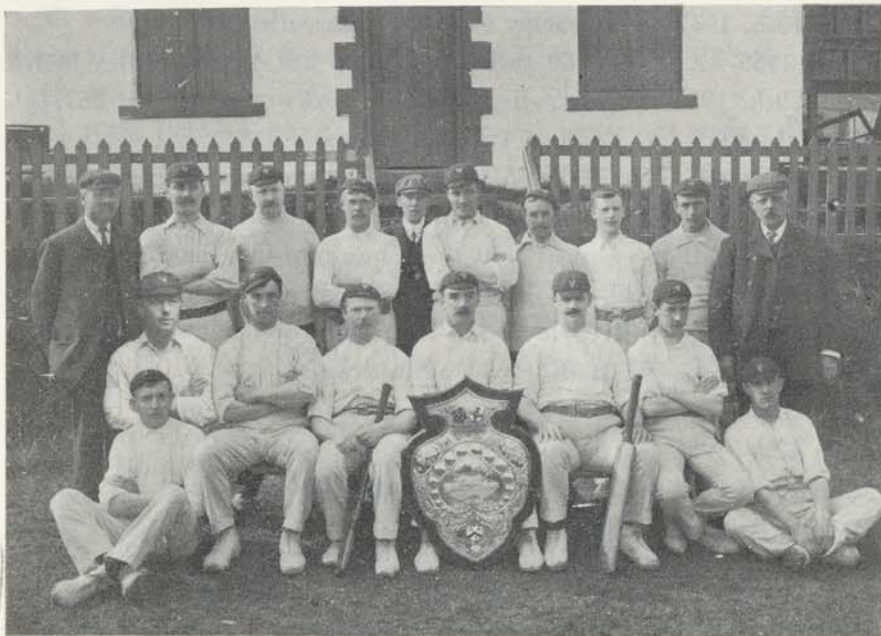
SECTION 'A' — 1905