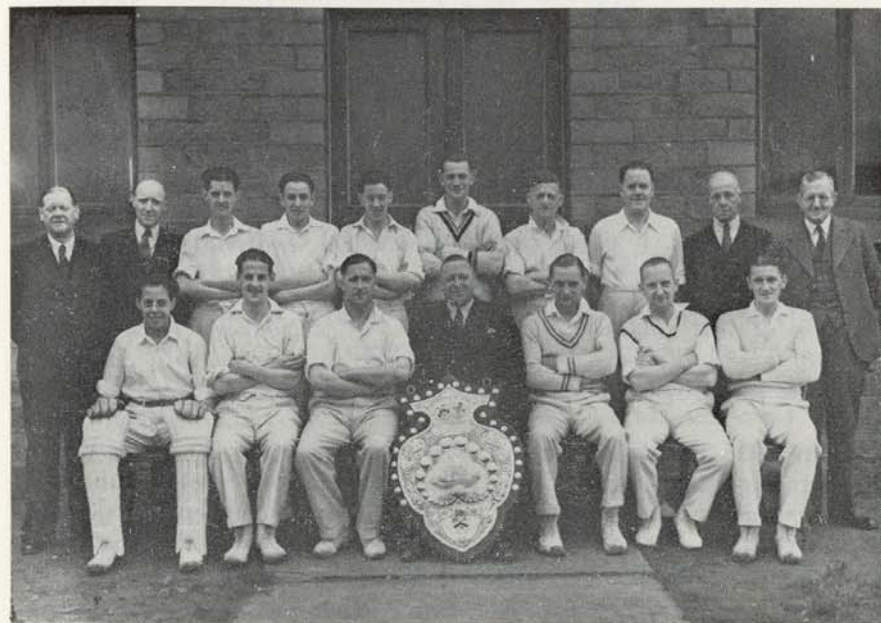
SECTION 'A' — 1944