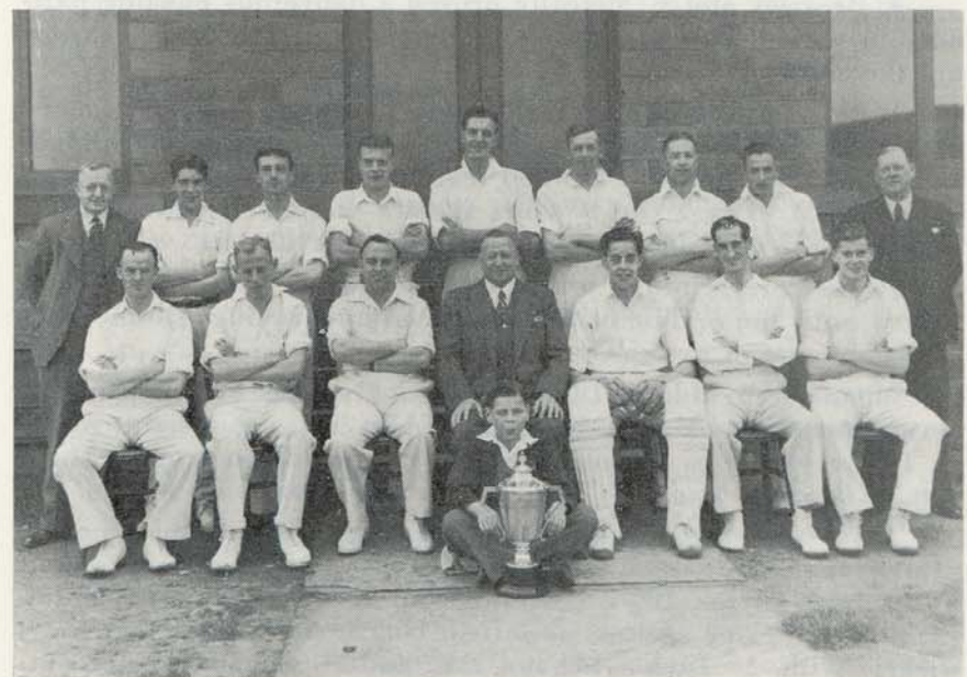
SECTION 'B' — 1947