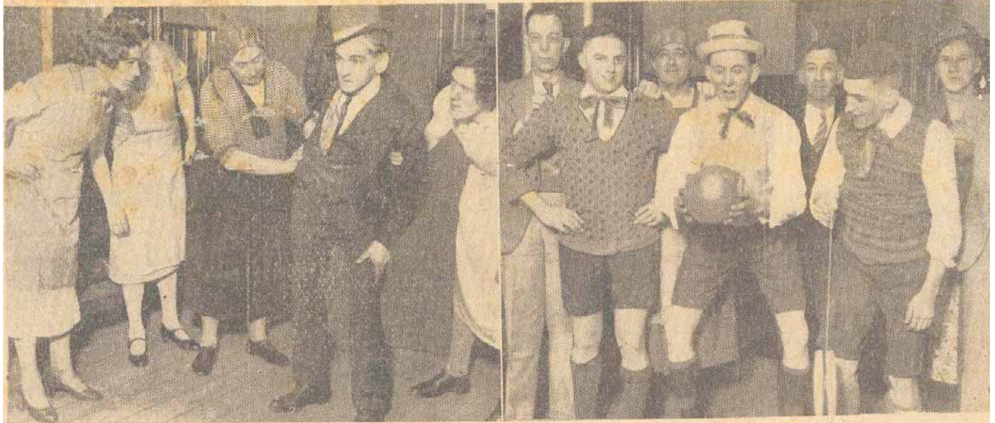
COMEDY exemplified by the men of the New Road Sunday School, in their production in the schoolroom, on Saturday and Tuesday evenings. The humorous nature of the show can be seen from the pictures.