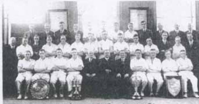
2ND TEAM WEN LEAGUE 7 TIMES. CUP 10