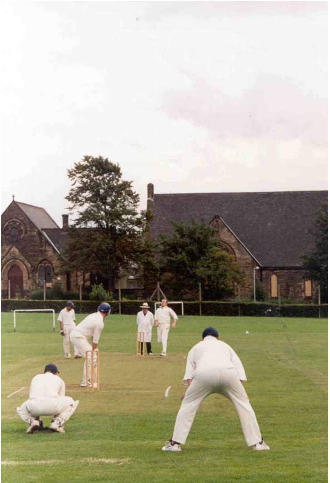
Healds Road today