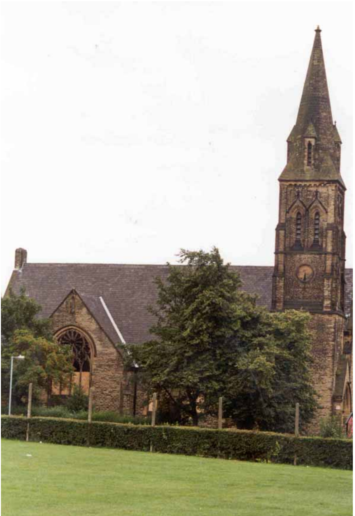
The church sits adjacent to the cricket field