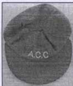
☐ CLUB MEMORIES: Clockwise (from above): a club cap; a team line-up from May 29, 1950; a member's card from 1965; the Walker Cup final line-up from August 3, 1953 and a programme cover from the Heavy Woollen Cup final of 1976.