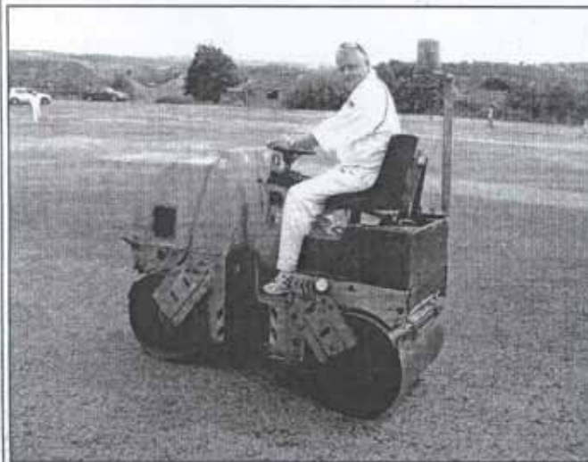
□ ON A ROLL: Working on the square at Edgerton