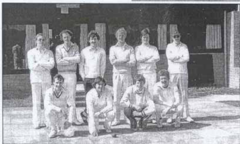
□ TEAM-MATES: An early line-up from the Edgerton team. Date unknown.

significant press release, broadcast on the Central League website: