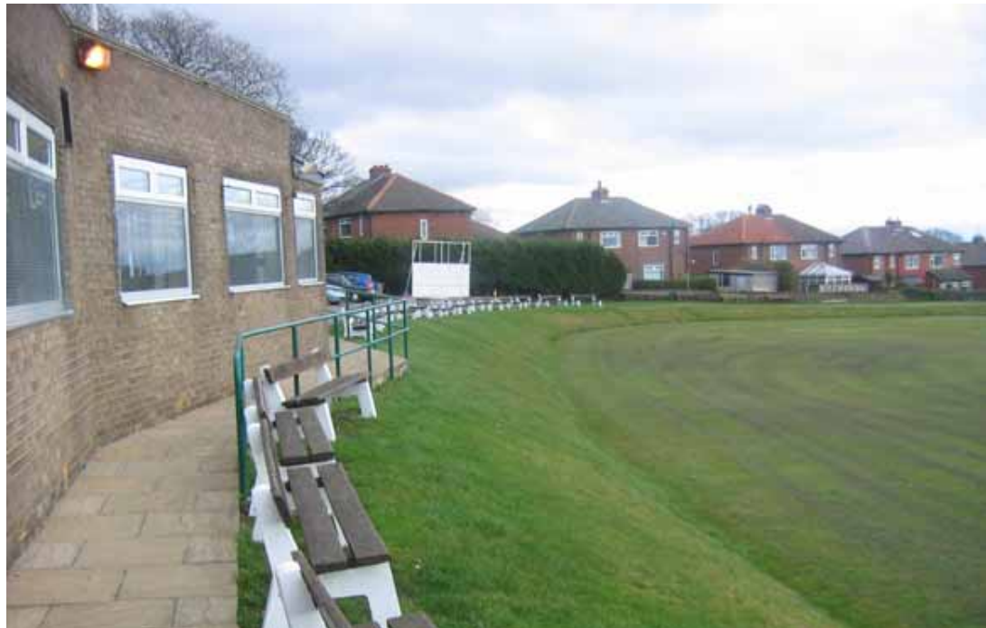
The clubrooms today

In 1933 a clubroom was added to the existing facilities at the ground: scoreboard, dressing-room block and tea pavilion.