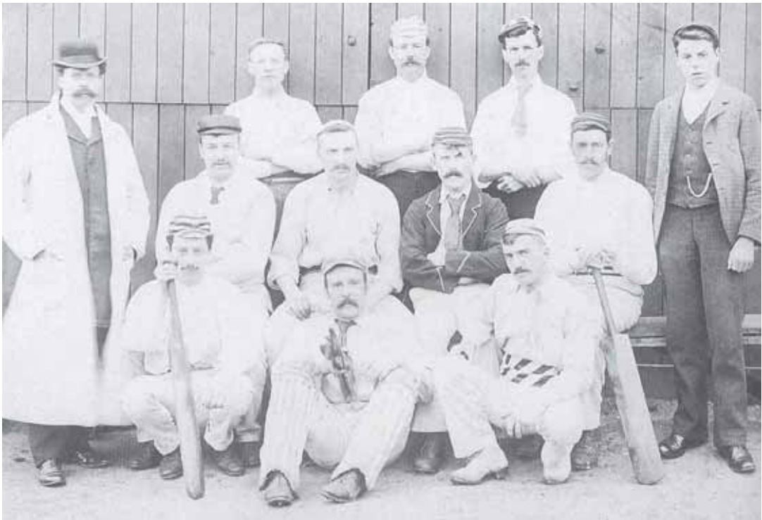
Birstall CC in 1900