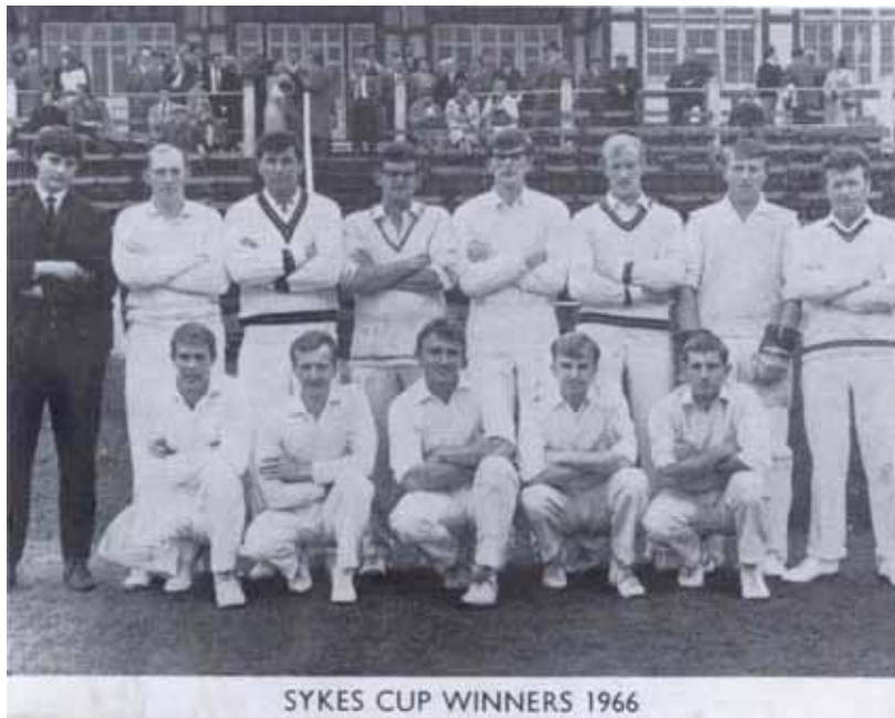
SYKES CUP WINNERS 1966