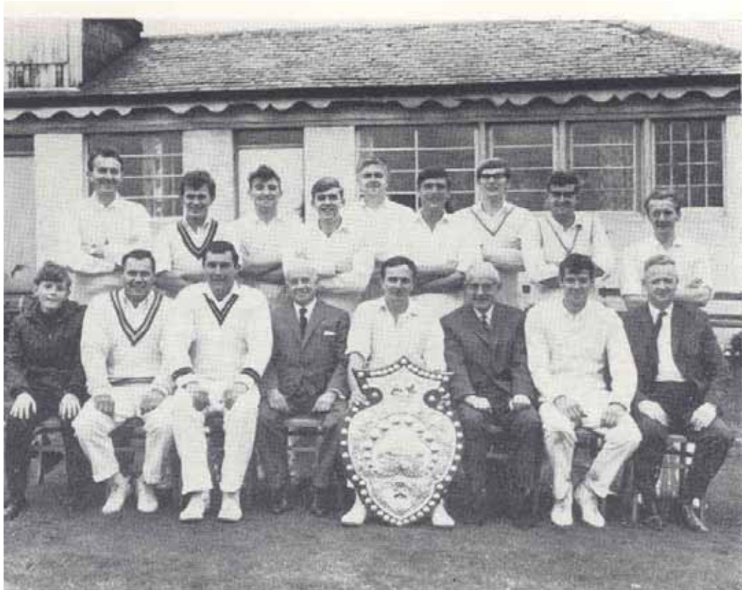
CHAMPIONSHIP WINNERS 1968