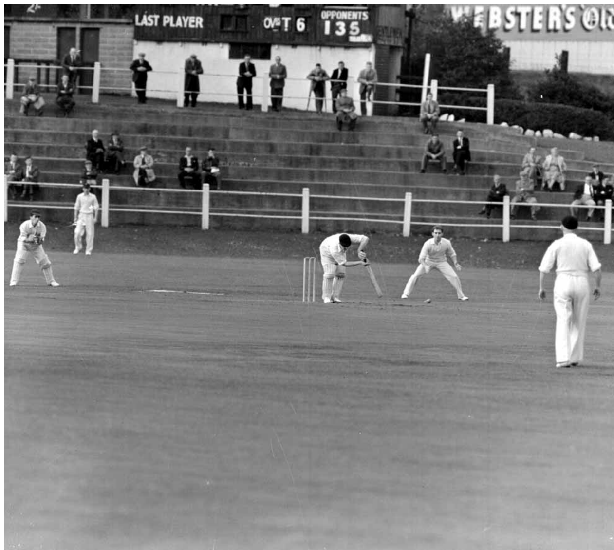
1960 (20 Jul) Sykes Cup Semi-Final - Lascelles Hall Batting