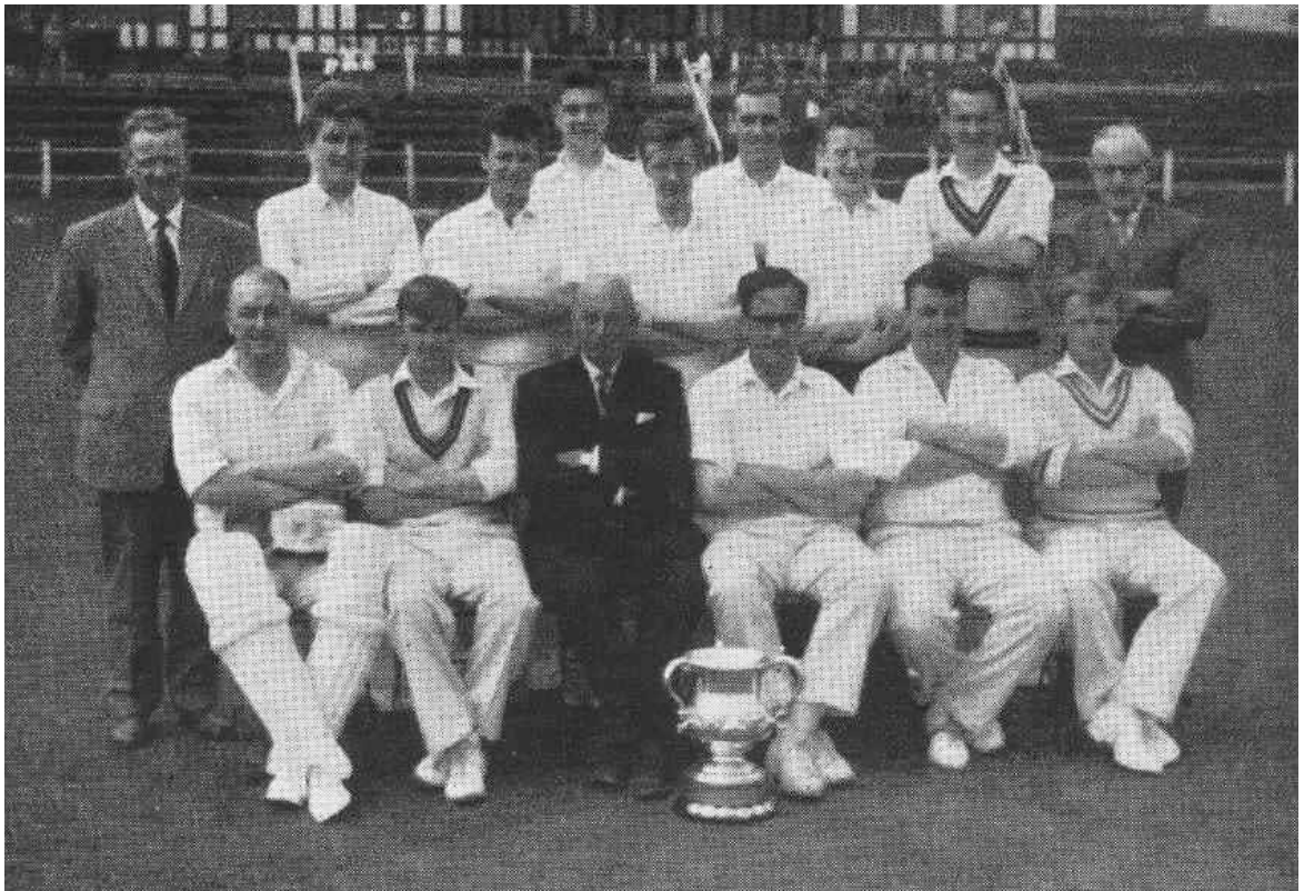
SYKES CUP WINNERS 1961