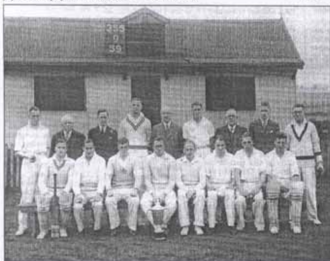
□ PRIZE-WINNERS: The 1933 Kirkburton first XI line-up which claimed the Huddersfield and District Cricket League Division 2 championship title