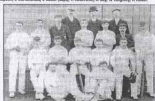
□ FASHBACK TO 1964: Kirkburton compete in District Alliance League

The new millennium heralded an array of Sykes Cup final victories and championship titles – and the future looks bright for the club from Riley Lane.