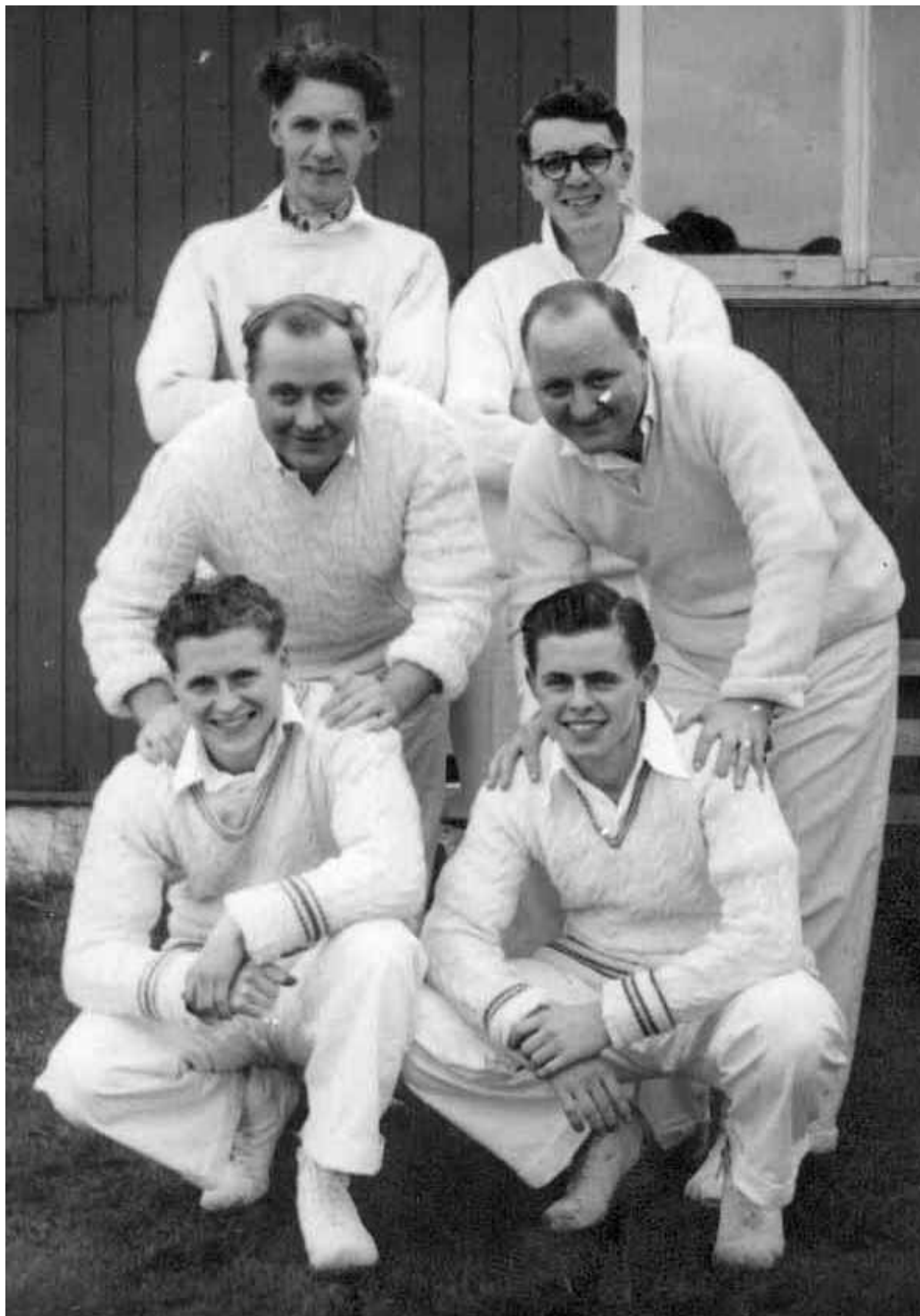
Three pairs of brothers

wicket to bat on - most of the time anyway. In one recent match, the team batting first scored 200, and the chasing side was all out for 11...'