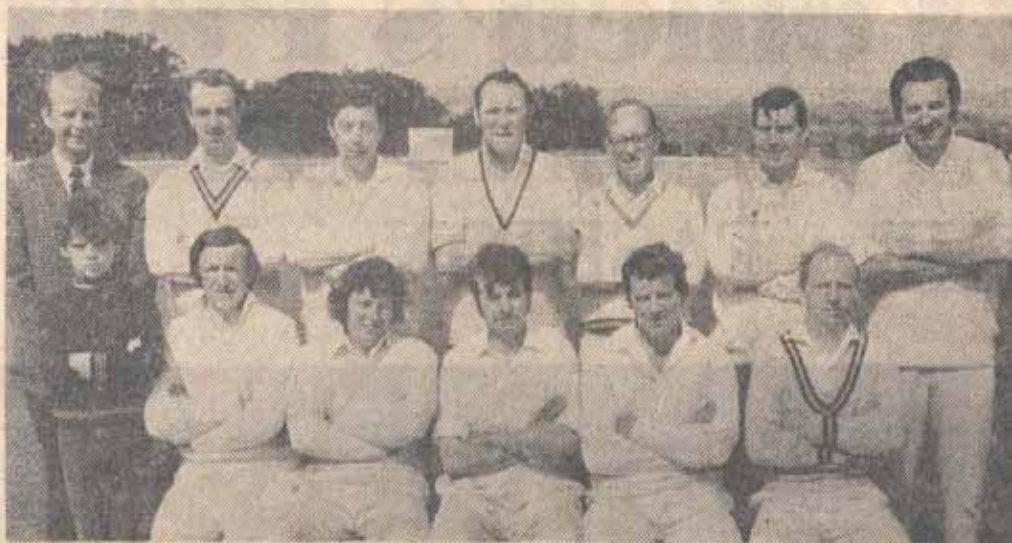
Mirfield Parish Church C.C.