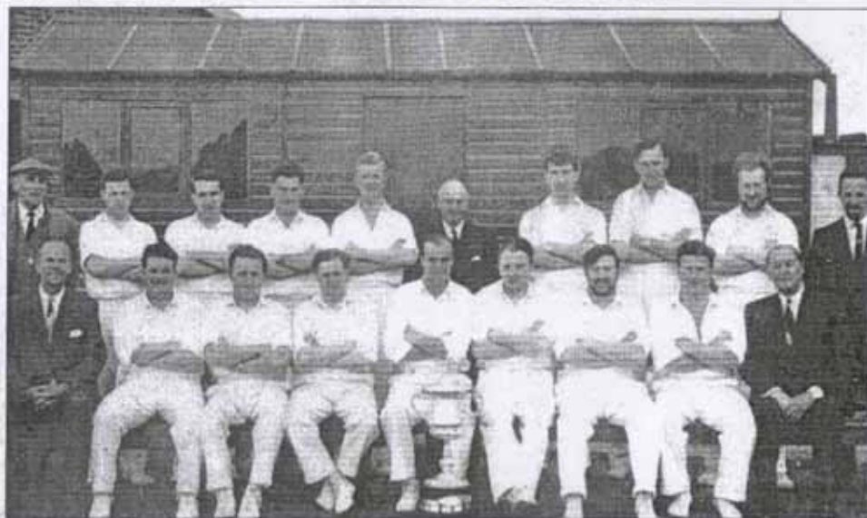
Trophy heroes: Northowram Hedge Top's Parish Cup winning side of 1965

Bizarre fact: Spectators can watch two games at once on a Saturday with Northowram Fields CC playing over the wall