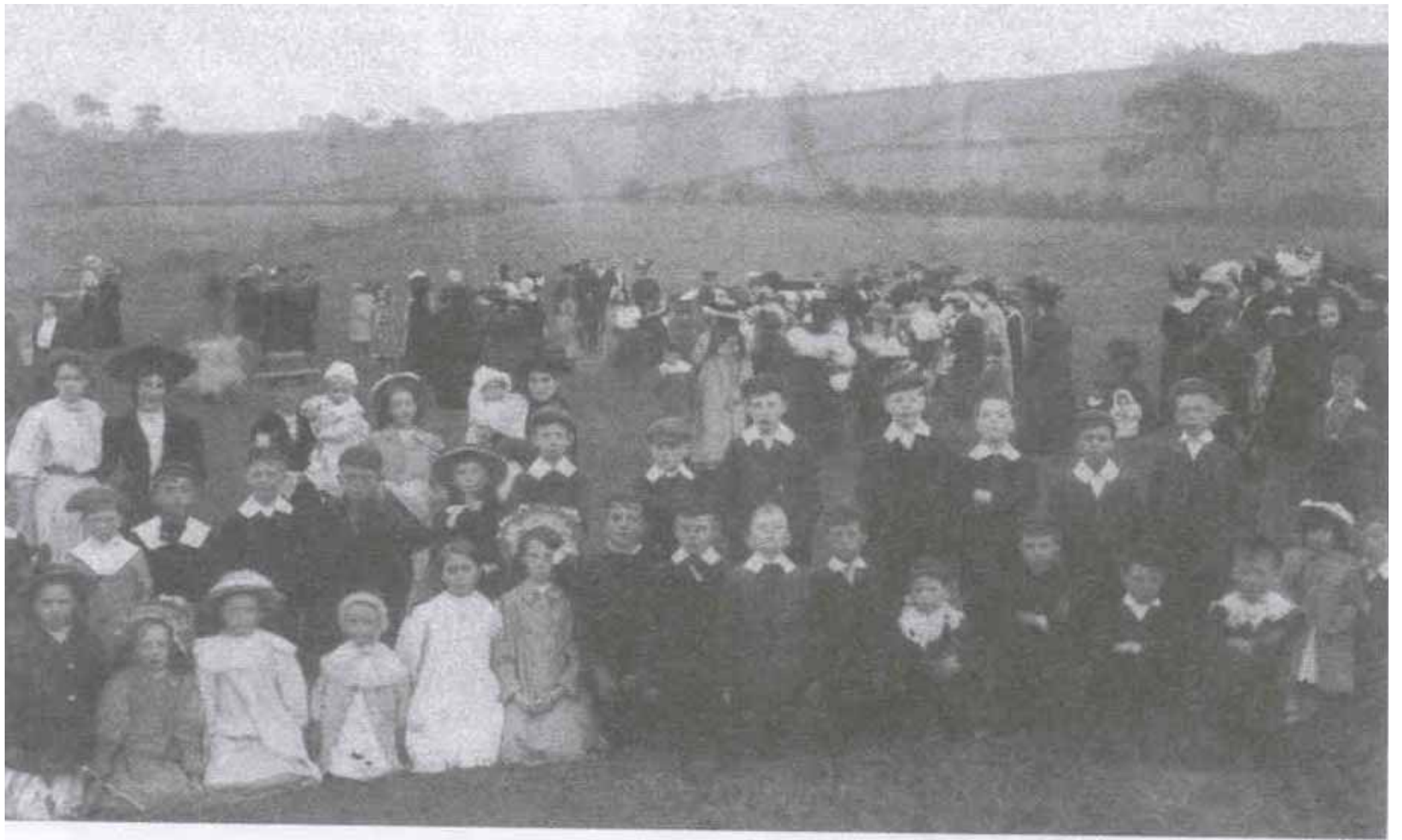
Gala and Cricket Picture