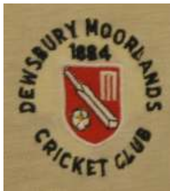
The DMCC badge

Press coverage in the local papers was virtually non-existent through the 1970s and disappeared altogether by 1980. Records of the league's affairs have not been located. This decade saw the end of the Mirfield & District Evening Cricket League; no-one seems to know when the last games were played. It would be interesting to know when exactly it ended and where the league's trophies are now.