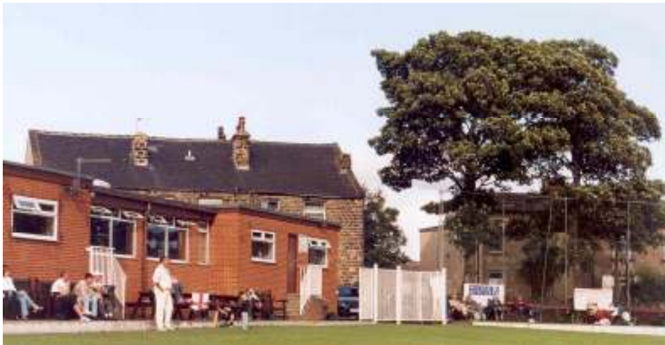
The home of Mirfield Parish Cavaliers today

The club became a mixed club in the early 1960s. The club's building is now gone and the playing field largely neglected; public protest has so far managed to keep the developers from taking the site. Several plans to bring the area back into public use have been discussed but to date (January 2009) nothing has come to fruition.