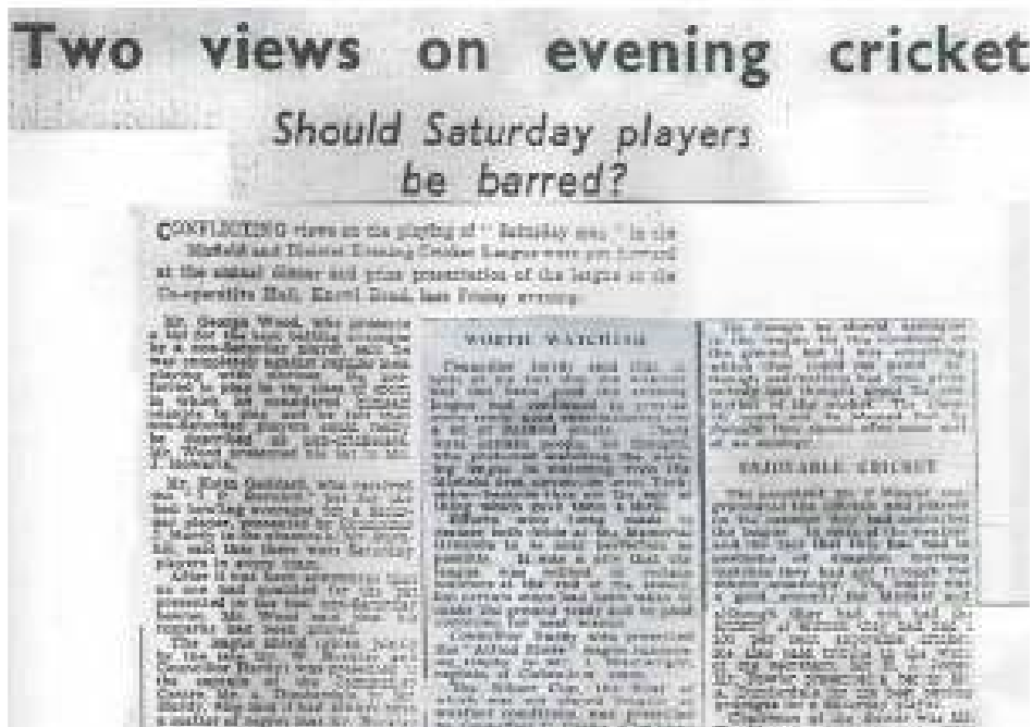
Annual Dinner and Prize Presentation, 1954

An inter-league friendly match had been played in July of this year against the Huddersfield Evening League at the David Brown's ground. It seems it was a very close contest, Huddersfield making a total of 142 all out and Mirfield making 142 for 9 wickets.