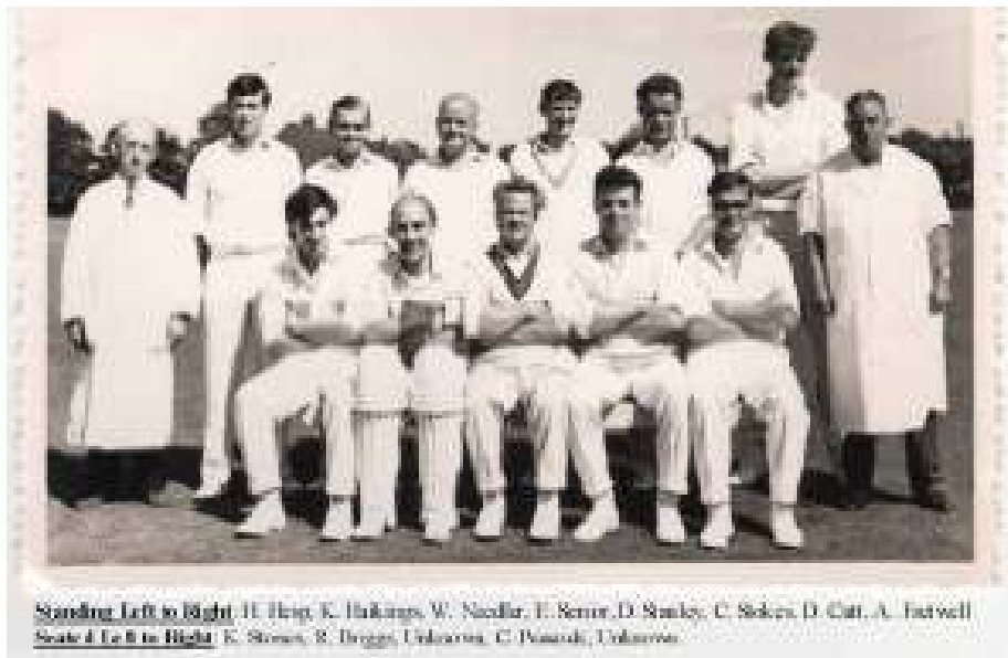
Buckley's XI, mid-to-late 1960s