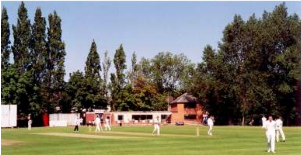
The Memorial Ground