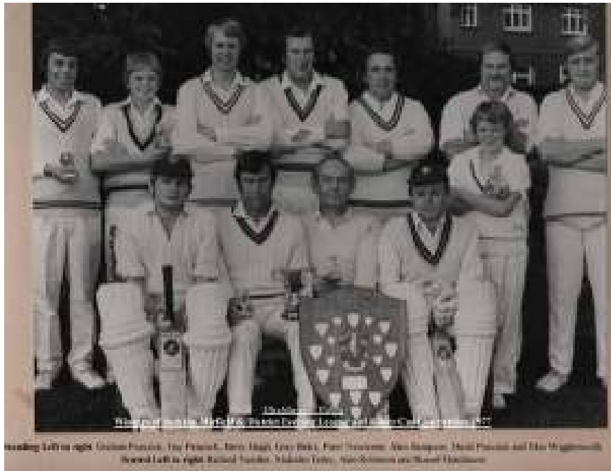
Cleckheaton Colts – winners of both the Mirfield & District Evening Cricket League and Kilner Cup in 1977

won both the league and cup competitions with a much strengthened side. Harry Lime were subsequently to merge with Mirfield Cricket Club when Mirfield C.C. went through troubled times in 2004/5.