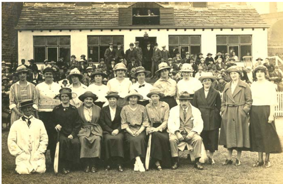
Greetland ladies cricket team (Halifax) c.1920s

ACS Conference University of Huddersfield, Castle Hill Suite Saturday 25 October 2008