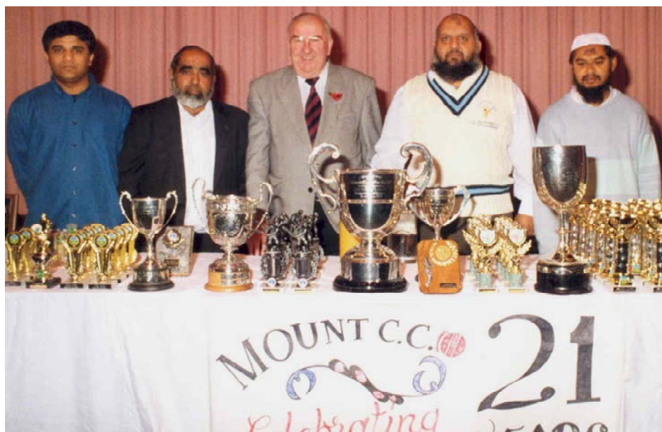
Mount CC (Batley), 21 st Anniversary celebrations

This Project received a £43,400 grant from the Heritage Lottery Fund, and also received an in-kind contribution of £7,000 from the University of Huddersfield. The Project aims to explore and celebrate the cricketing heritage of Calderdale/Kirklees, focusing in particular on the 100+ local league cricket clubs and grounds in the area.