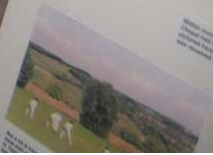
Members of the Lascelles Hall Cricket Club in 1911. The club was formed in 1811 and has since then remained the same.