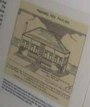
PROVIDED FOR FAULTON

Many cricket clubs have benefited from the generosity of wealthy or kind-hearted local figures. Landowners have donated land to play on, (or rented it out for a nominal fee). Some benefactors saw it as their duty to support the local community. Others developed a long association with clubs, with family members being given honorary roles such as that of president.