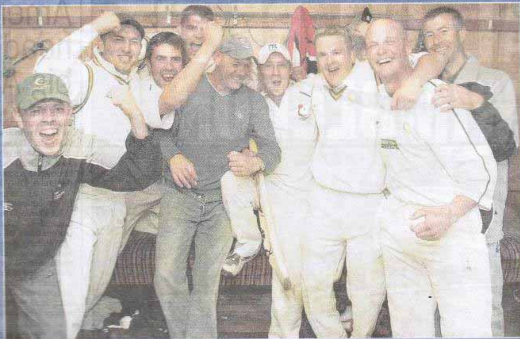
■ WE'VE DONE IT: Slairwaite celebrate their Romida Sykes Cup quarter-final win over Colne Valley rivals Golcar. The 10-0-0-0-0-0 success, which earned a place in tomorrow's semi-final draw, was sealed last night.