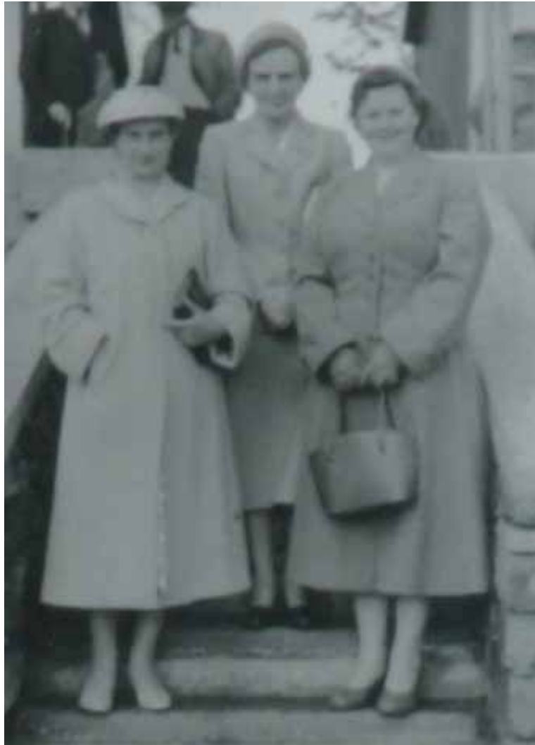
More women members at Old Town CC - undated