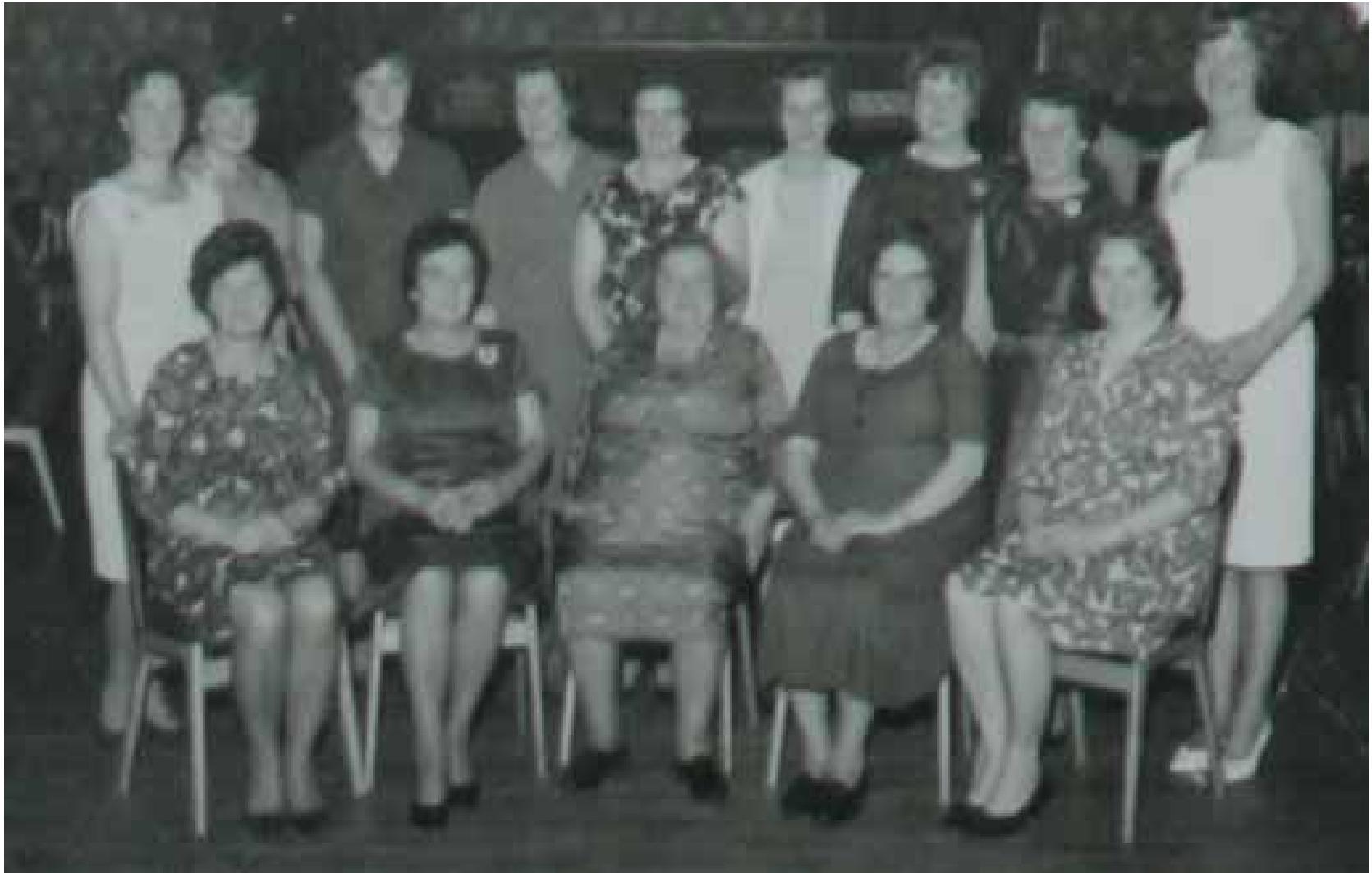
An undated photo of the Old Town CC Ladies Committee