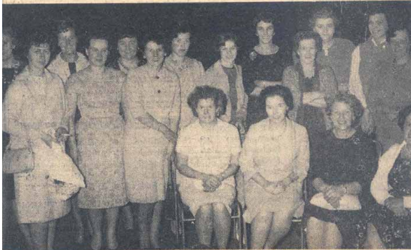
A group of members of the ladies' committee of Mytholmroyd Methodist Cricket Club who handed over £50 to club funds at the annual dinner last Tuesday evening