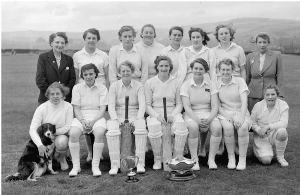
A ladies team from 1954. Can anyone tell us which team it is?