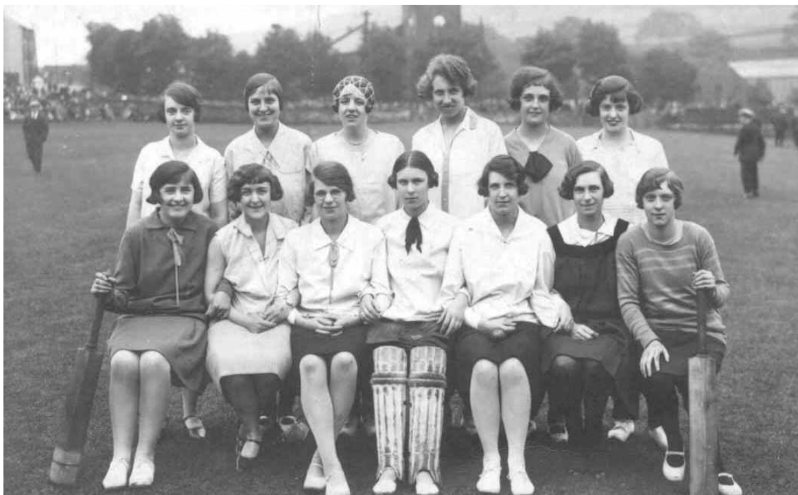
Low Mill Ladies CC

In the 1960s we encounter an array of women's cricket teams in the Holmfirth area. Can anybody tell us who photos 2, 3 and 4 are of?