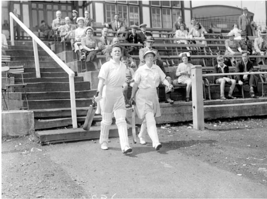
Ladies XI, Festival Week, Yorkshire v Cheshire, July 1949

This development threatened one of the major assumptions about sport, and cricket in particular; namely, that it was very much a male preserve.