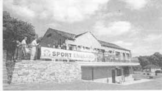
The impressive clubhouse and pavilion