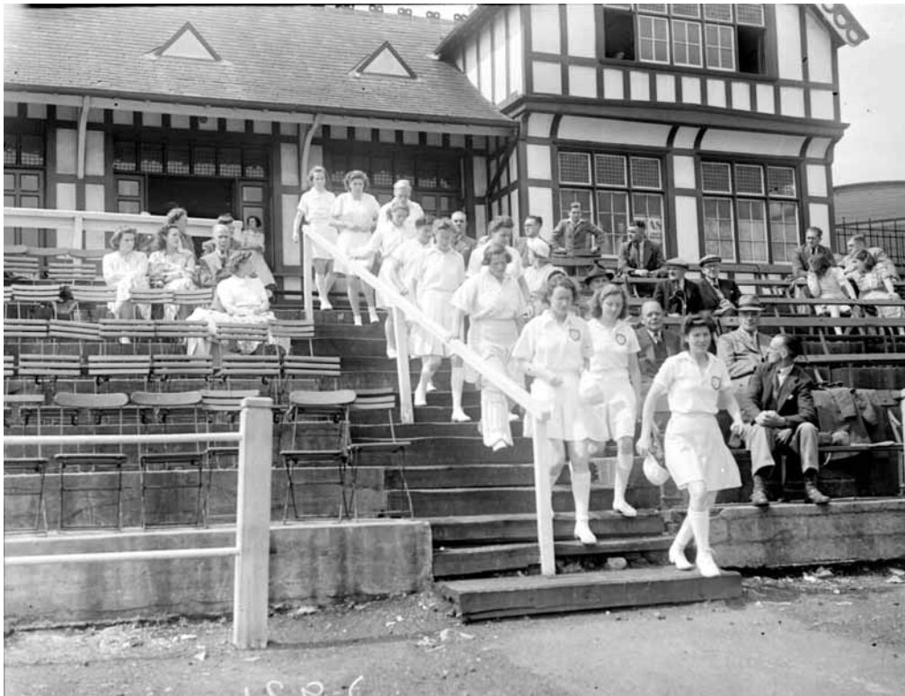
Ladies XI, Festival Week, Yorkshire v Cheshire, July 1949