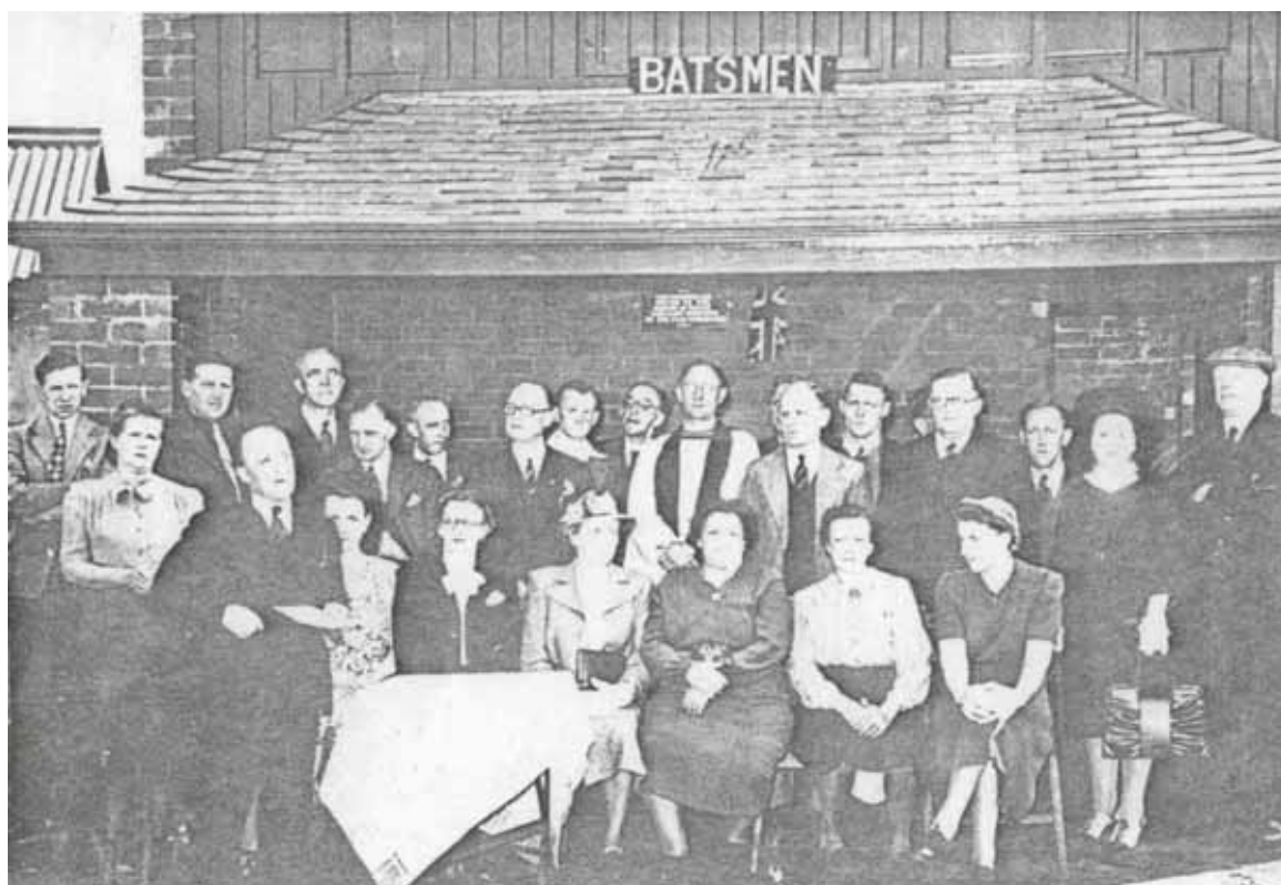
Another photo of Birstall ladies in the '50s

It would organise its own events (jumble sales, clothes evenings etc), pay in the takings to its own bank account, and then donate money back to the club as and when it was needed for specific purposes.