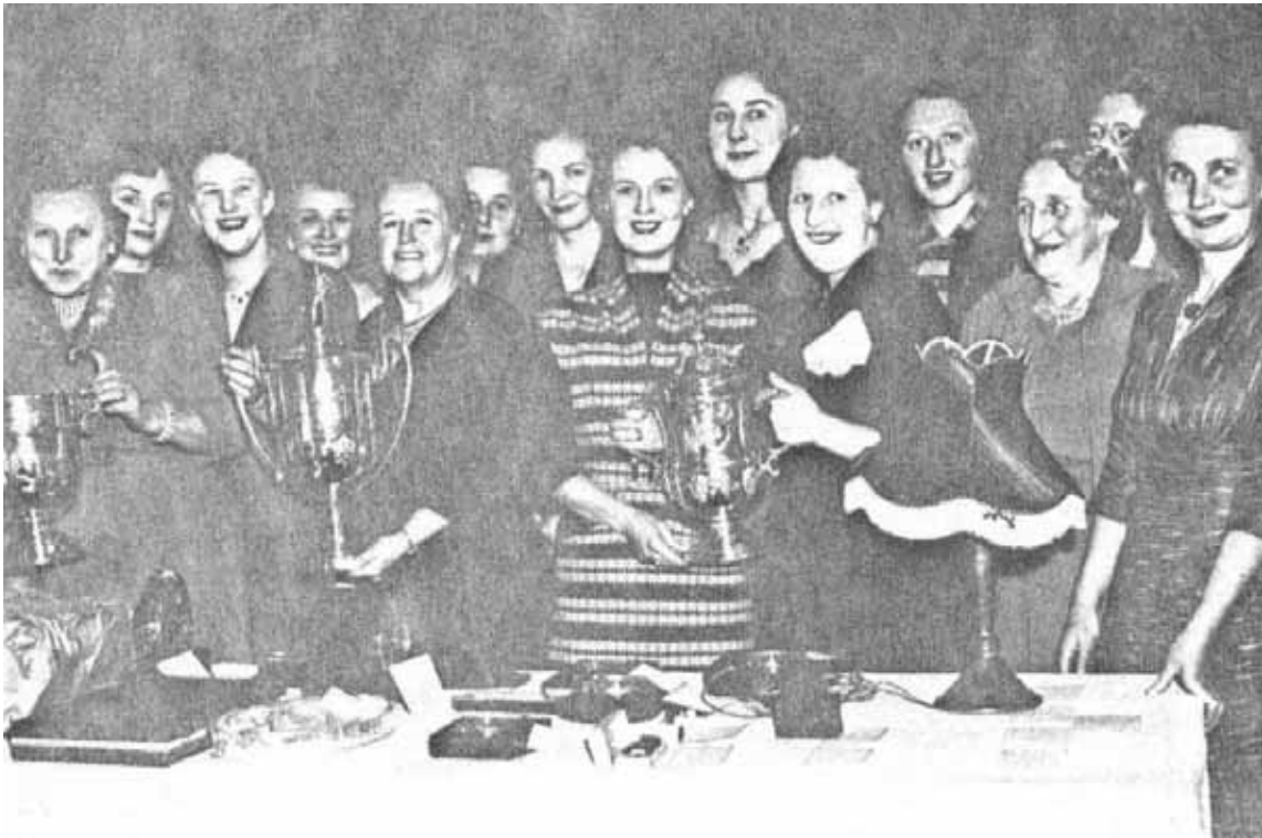
Birstall ladies in the 1950s

In the post-war years (in particular), it was quite fashionable for local cubs to have their own 'sub-group' of willing female members.