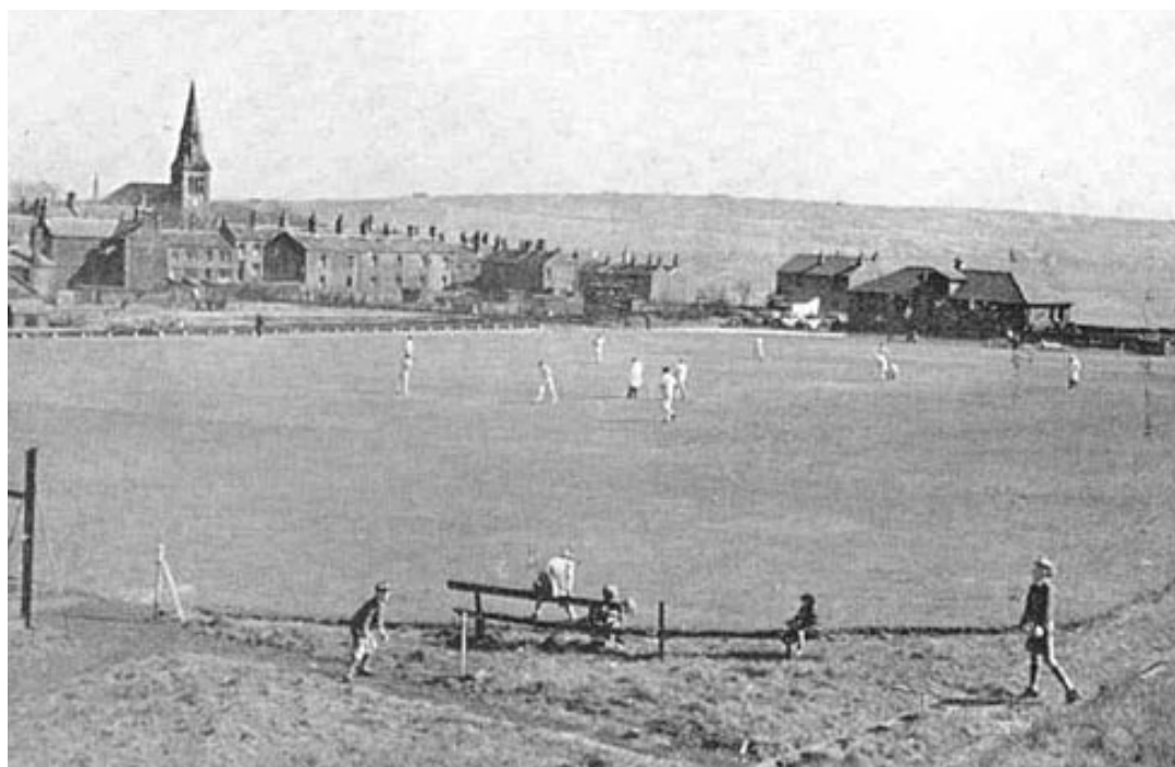
Swallow Lane, Golcar, in 1951

By providing the food themselves the ladies saved the club considerable expense.