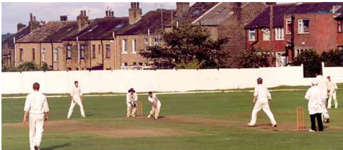
Cross Lane, Primrose Hill