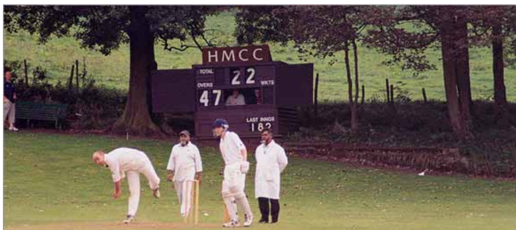
Woodbottom – home of Hopton Mills