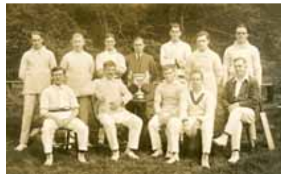
Greetland CC (1911)