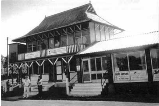
The Pavilion at Honley