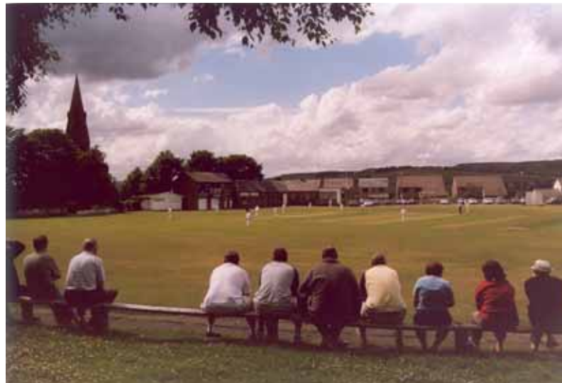
Broad Oak's home ground