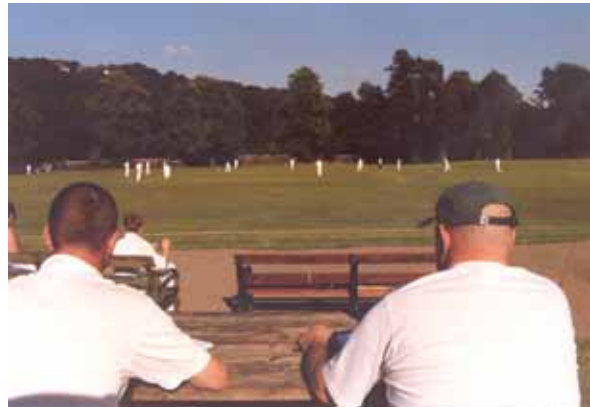
Woodfield Park: local rivals

Since joining the Huddersfield Central League, FMA have achieved a succession of promotions, and in recent years have only been a stone's throw away from the Premiership.