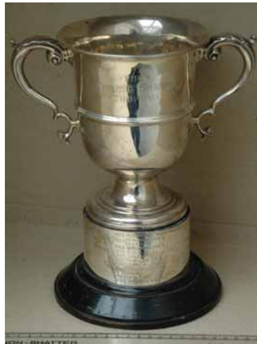
The Sharpe Trophy (now in the Tolson Museum)

In 1979 Birkby FMA scooped the Huddersfield Association League Sharpe Trophy, awarded to the team obtaining the most points in the last 6 matches.