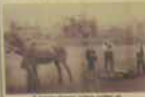
A group of men working in the fields, 1900.

Early on, immigrants of the district had a hard time adjusting to the hot weather and the long hours of hard work. They often had to work in the fields for long hours.