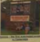
Group of people sitting at a table, 1900.