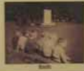
Screen test, 1900.

Screen tests were used to check the eyes of immigrants. They were often done in the evenings. Some tests were done for free, while others were for a fee.