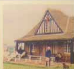
Northwood Green's pavilion, built in 1930