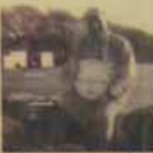
Man sitting on a horse, 1900.