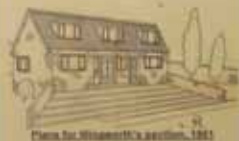
Plans for Wilsden's pavilion, 1961