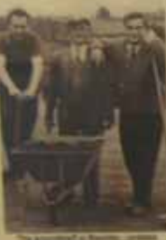
A family portrait, 1900.