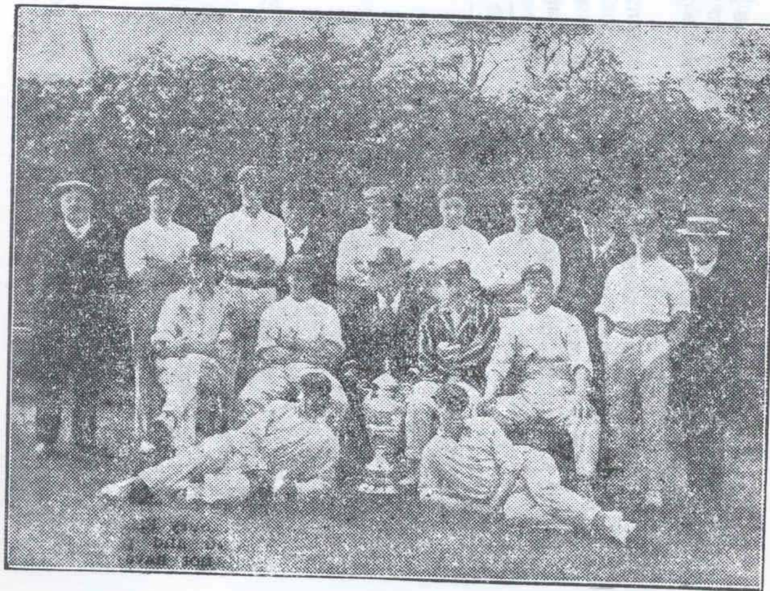
Chickenley 1913, beat Dewsbury, 89 — 90 for no wicket.