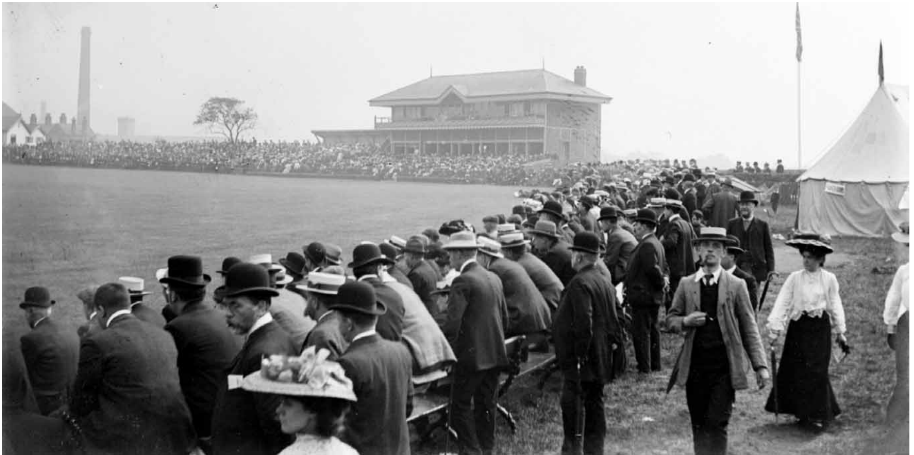
Probably a county match – note the amount of spectators in attendance and the way in which they are dressed