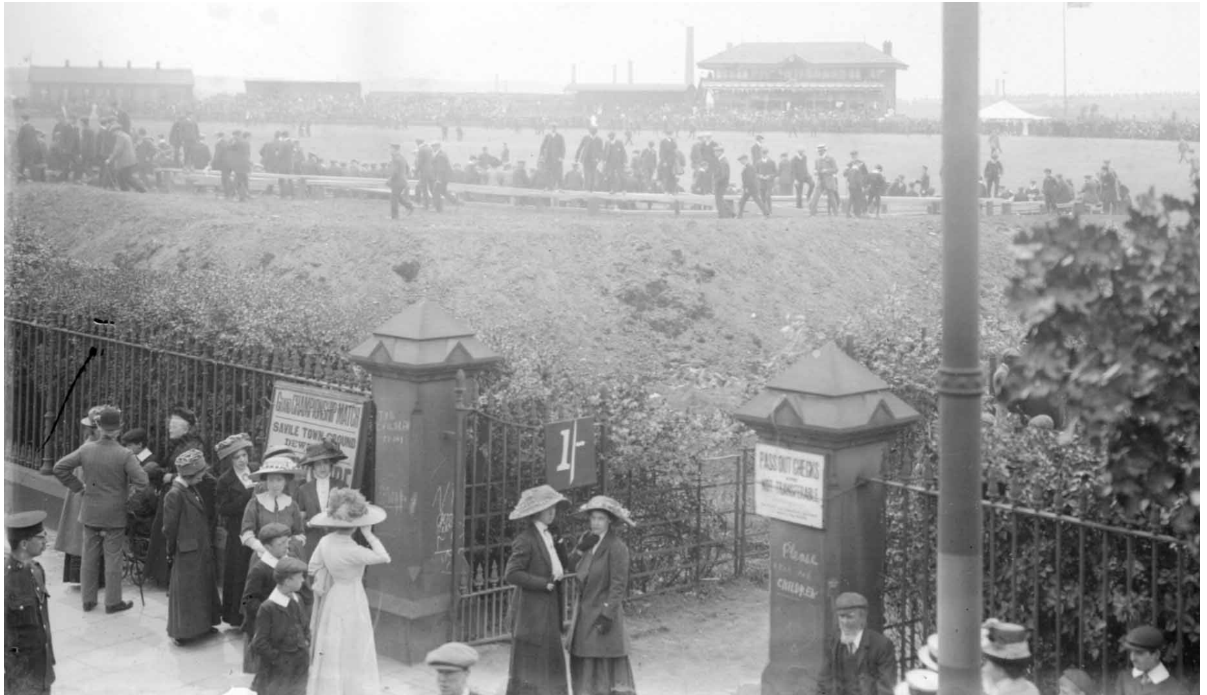
The turnstiles – again, probably at a county match