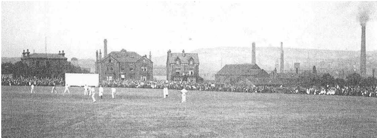
The Savile Ground in 1910. At this point in time the sightscreens were large white sheets