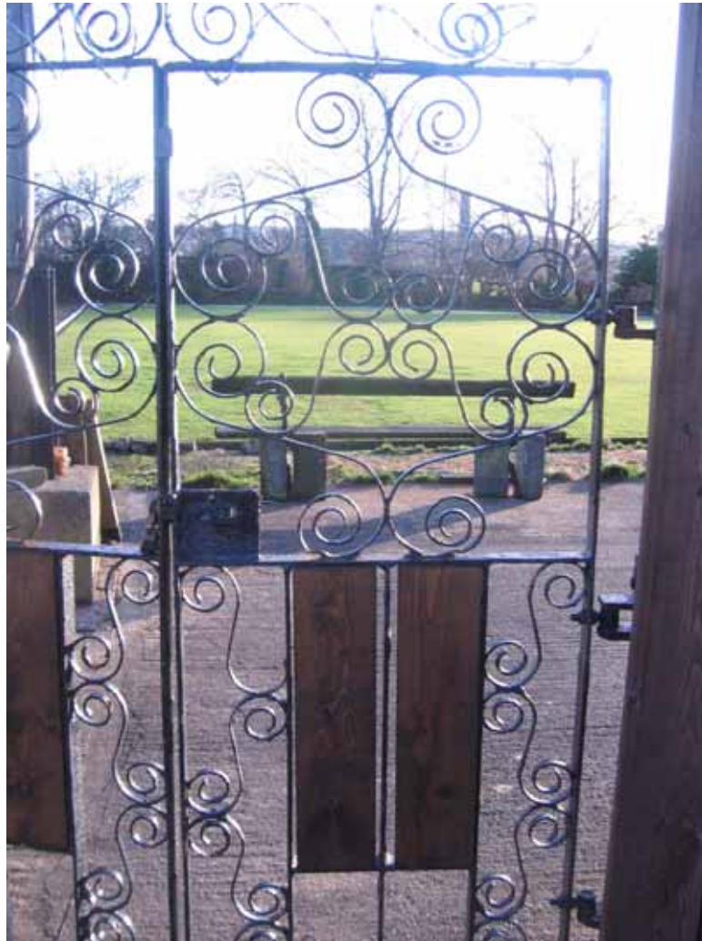
Looking in through the gate of the Working Men's Bowling Club