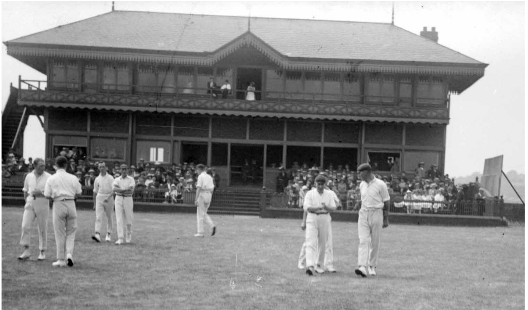
The grandiose pavilion