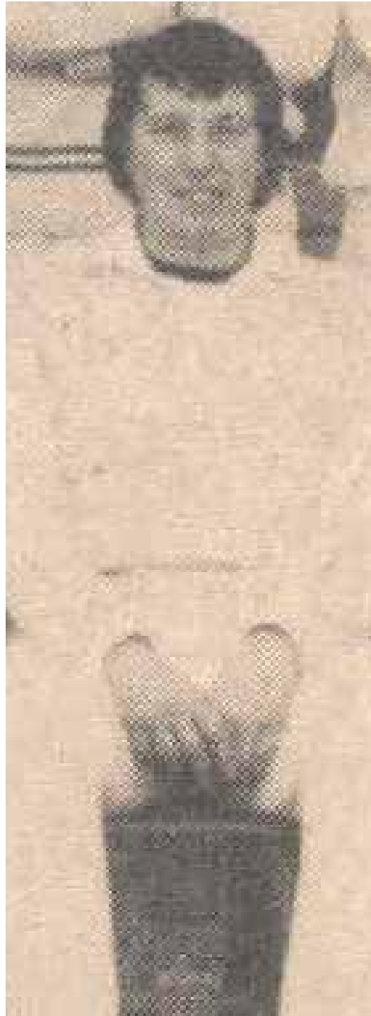
Dewsbury CC captain in the 1970s.