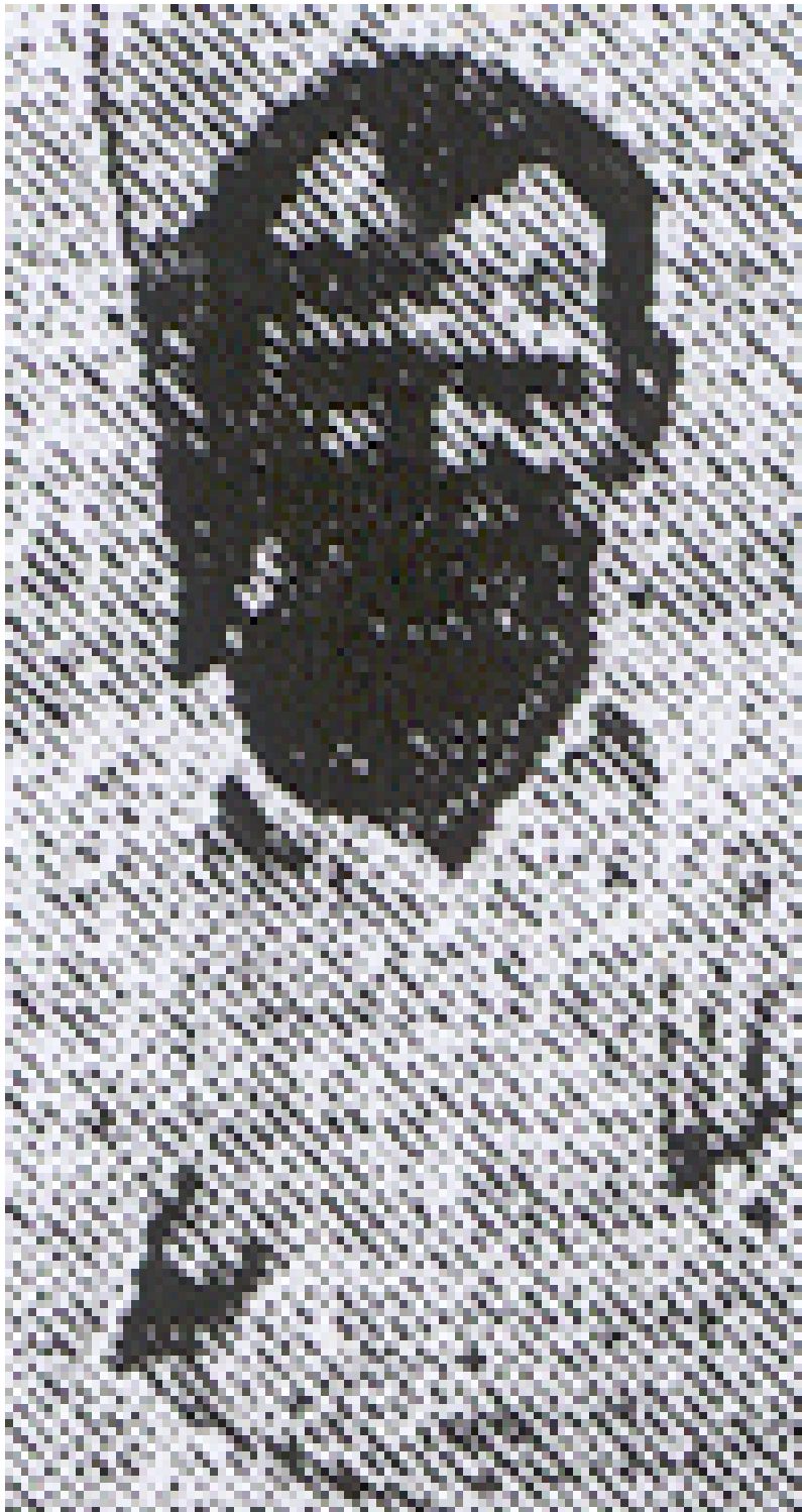
Dewsbury skipper in the 1960s.