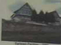
Old Pavilion - 2008

The Old Pavilion stands tall and proud 75 on today marks its 75th birthday The old game continues on all 7 will You'll find a lot of people still playing it to day