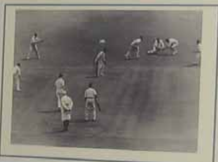
CRICKET IN KIRKLEES PEOPLE AND PLACES