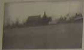
FARTOWN THEN AND NOW