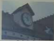
The Pavilion Clock

History and the Old Lady with the best cricket in the world It's a lot of fun and the weather is just what you need The game is still there but it's not the same