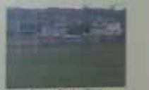
Current Cricket Pitch - Currently used for Tests

The game has continued into a new era The game is played up with passion and a love