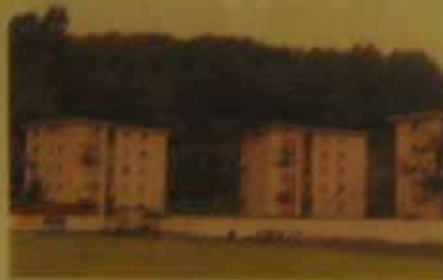
South Street, Halifax

Gradually, the development of urban and industrial life has the need to look after their workers, to be generous and thoughtful.