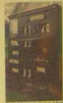
Cricketing in action at Lutterworth.