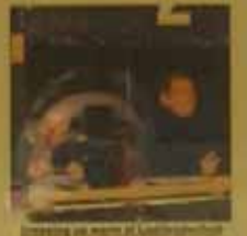
Cricketing in action at Lutterworth.

Cricket, unlike most other sports, does a high value on the contribution of the 'non-player'.