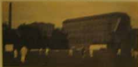
The mill, Halifax - in the shadow of industry

During the Industrial Revolution of the nineteenth century, the growth of the mills around West Yorkshire, Halifax and neighbouring towns were transformed by the process.