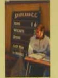
Cricketing in action at Lutterworth.

As some grounds they may have returned to a small square 'hole in the wall', but more often than not, they are still the most vibrant communities.