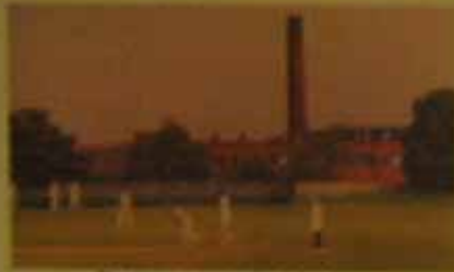
The massive construction, Gifford Street

There are structures all over of urban development, with urban life being made to go with housing, factories, roads and other things.