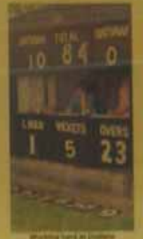
Cricketing in action at Lutterworth.