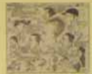
Cricketing in action at Lutterworth.

As some grounds they may have returned to a small square 'hole in the wall', but more often than not, they are still the most vibrant communities.