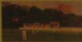
Halifax Street, formerly Halifax, westward of between Halifax and Fife

Calderdale is a predominantly rural area, but it had to face the urban boom after World War One.