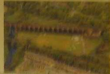
Calderdale Viaduct, built to carry the line over the valley.

In the 1950s the building of the Calderdale Museum, Calderdale, was begun by the Calderdale Council.