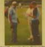
Cricketing in action at Lutterworth.