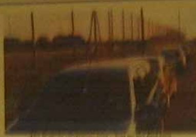
The canal at Calderdale, built to link the two main roads.

Black and white photograph showing the construction of the line.