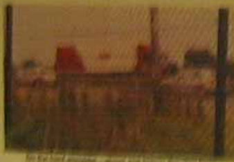
The factory building, built to house the new line.