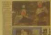
Cricketing in action at Lutterworth.