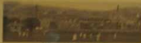
An industrial development in Bradford

One way to do this is to provide social housing, to give to the workers. You have worked hard for it - it is not a gift, it is a reward for your hard work.