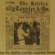
From the Wharfedale Gazette , 1908. The Wharfedale Gazette , 1908.

Local newspapers and their associated free sheets are essential tools in researching local cricket history.