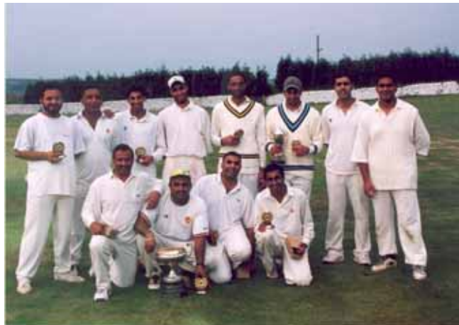
The mighty QRM

Hebden Bridge produced one of their performances of the season, just failing to deny Queen's Road Muslims the win they needed to claim the Halifax Association title.