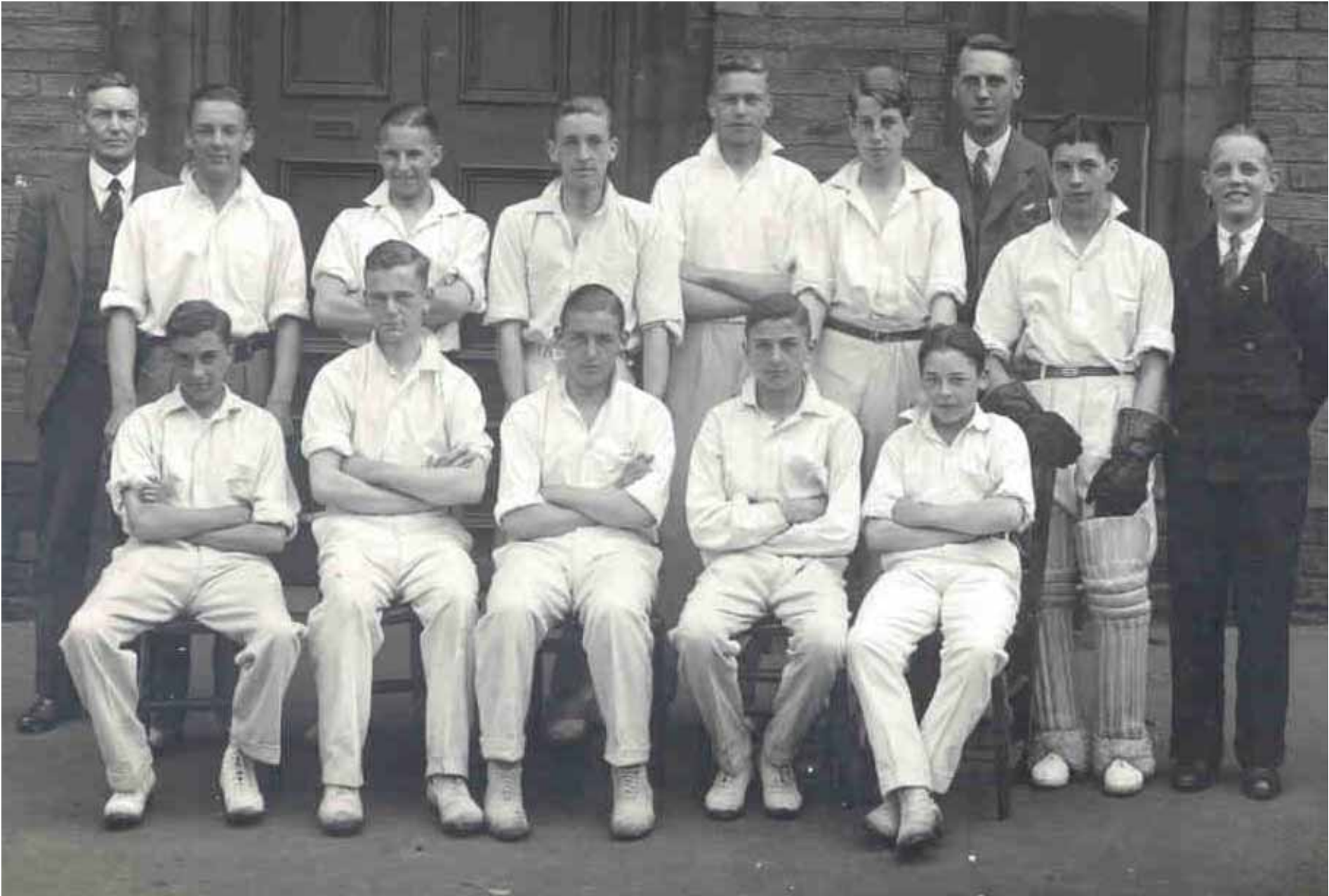
1931 Team Photo: