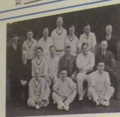
The Boys of 1954