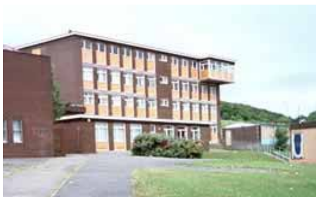
Fartown High School

Their first fixture of their debut season pitted them against Birkby FMA at Fartown High School - and SNOBS were bowled out for 32.