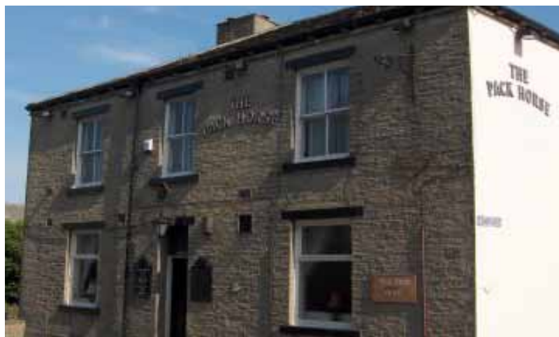
The Pack Horse in Southowram – the cricketers' local in Victorian times

This field adjoins Greenwood's Quarry near the Pack Horse Inn. It measures 125 x 100 yards and has a laid crease 30 x 20 yards, a good though small pavilion and seating for about 60. Both crease and outfield are good though the later is somewhat uneven in contour.