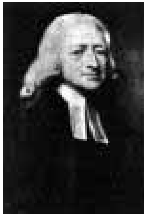
John Wesley – founder of Methodism

But the village's Methodist cricket team would stay in business until the eve of World War Two.