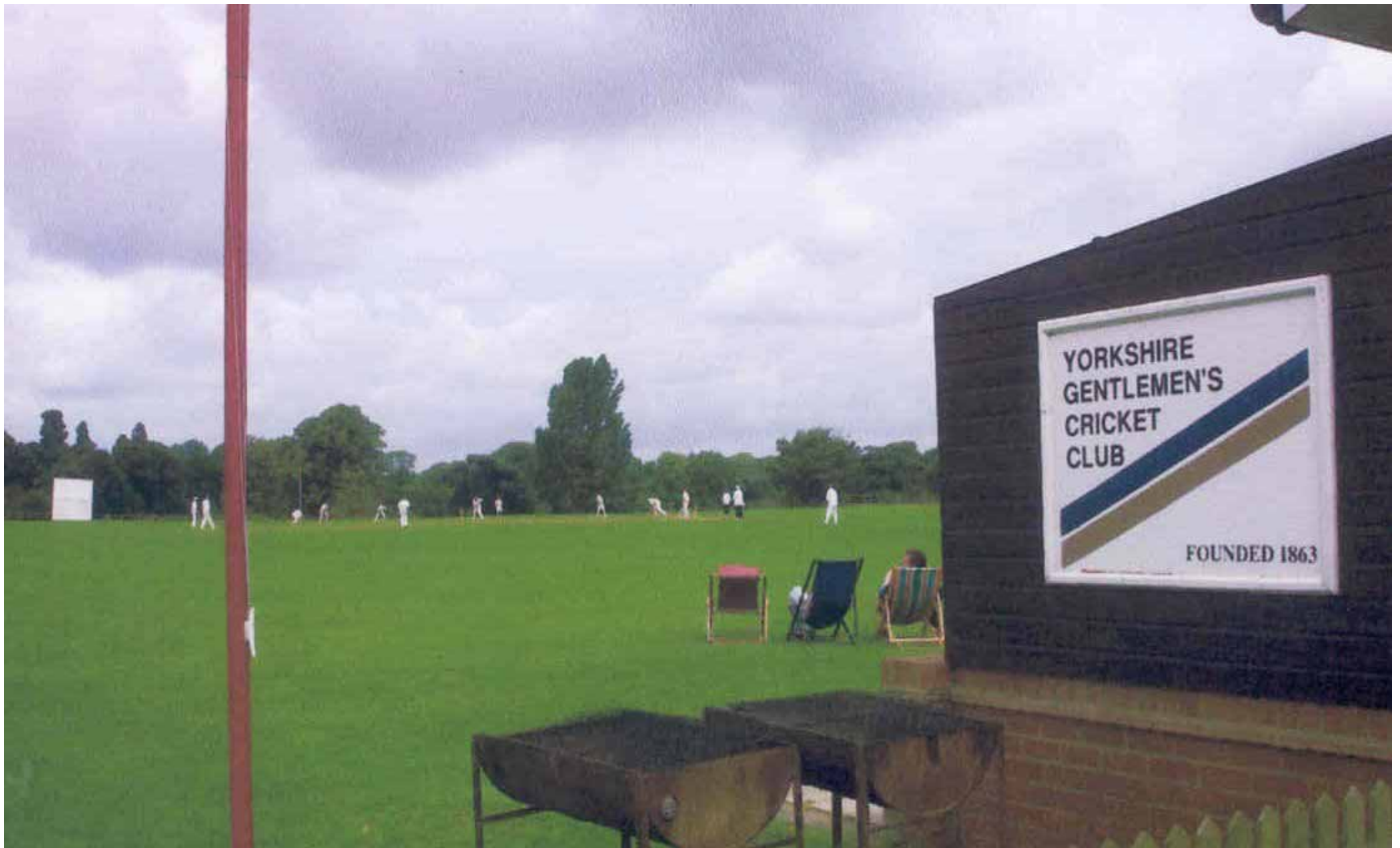
24 Sherriff Hutton, North Yorks