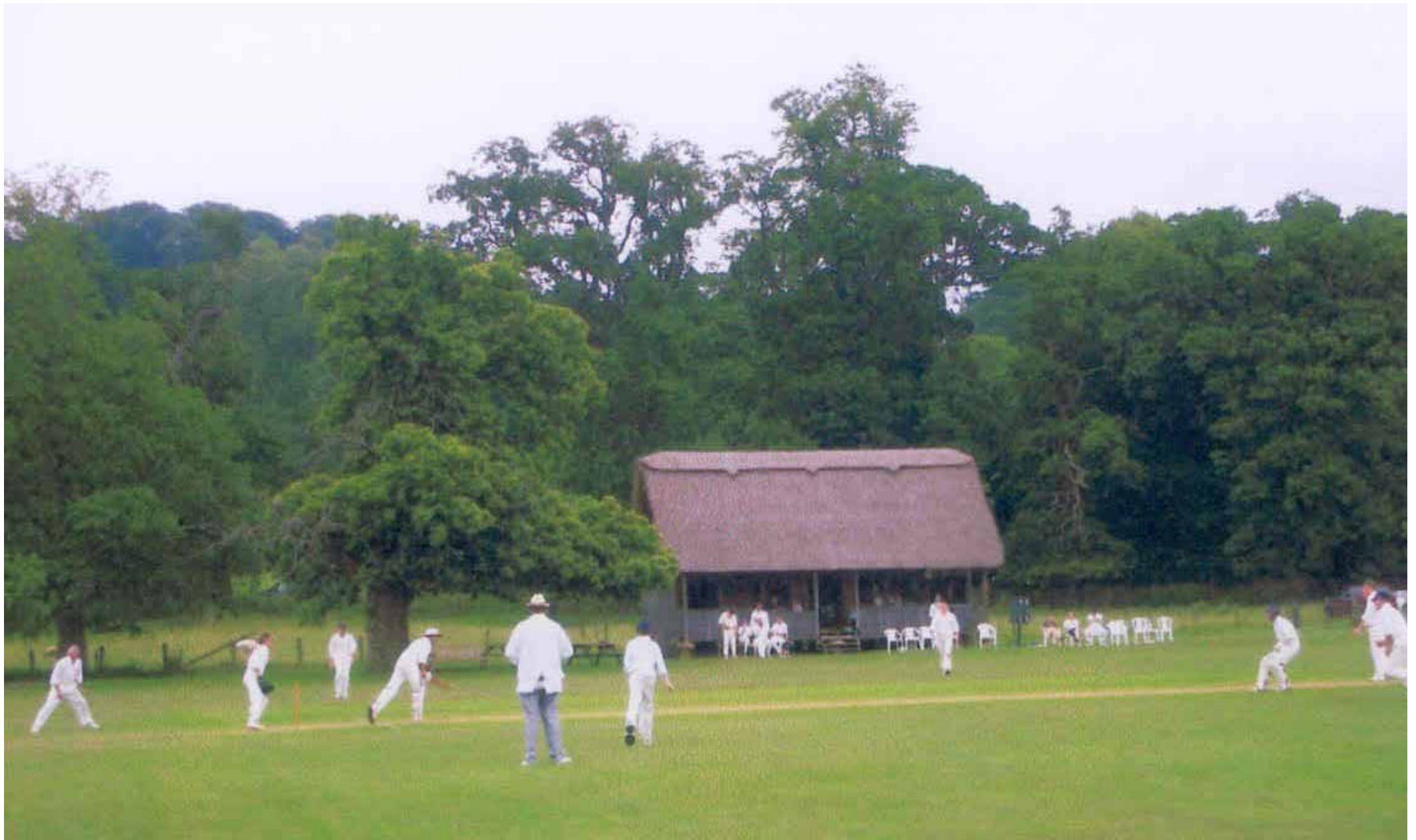
17 Stanway, Gloucestershire