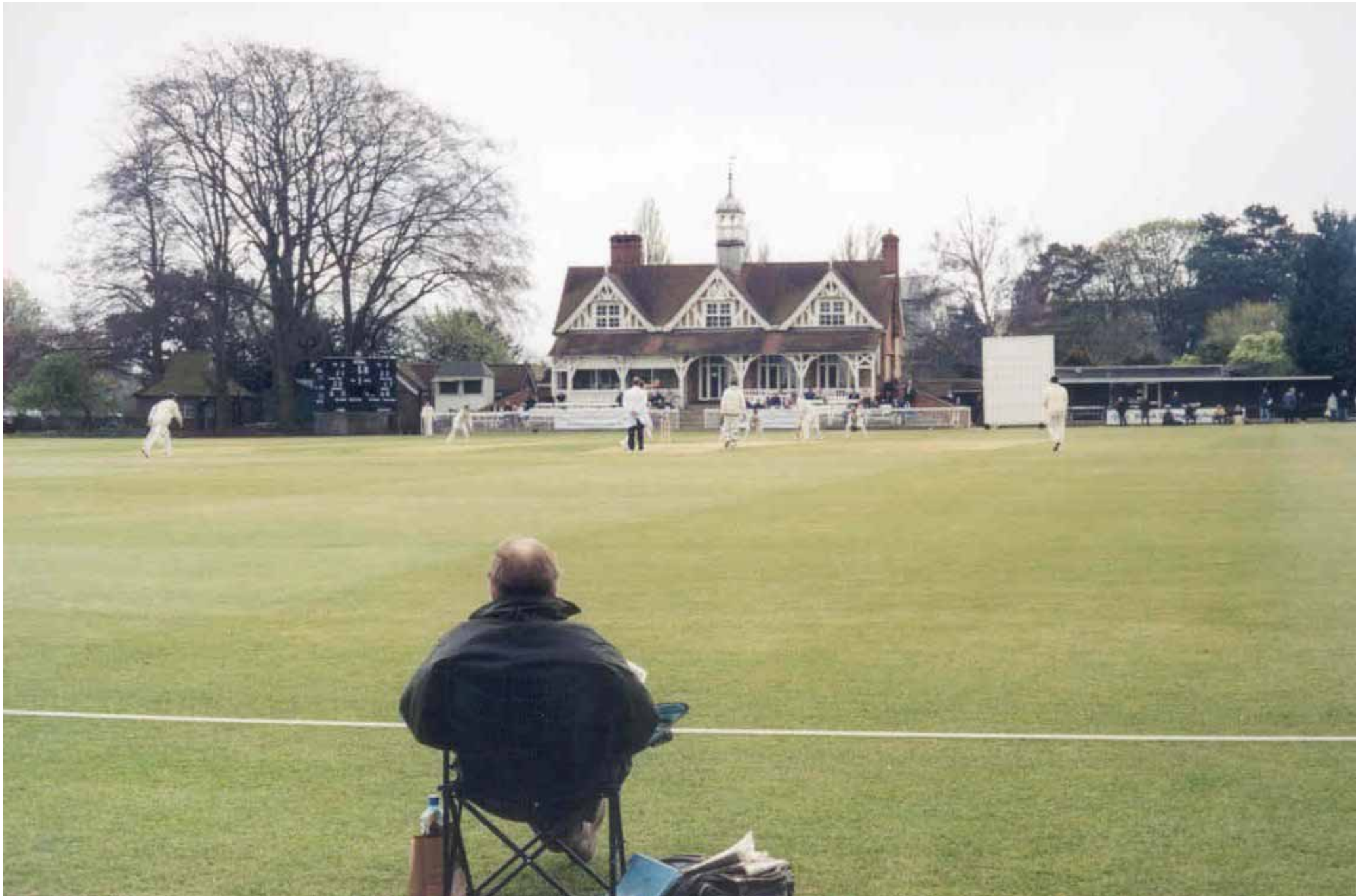
2 University Parks, Oxford