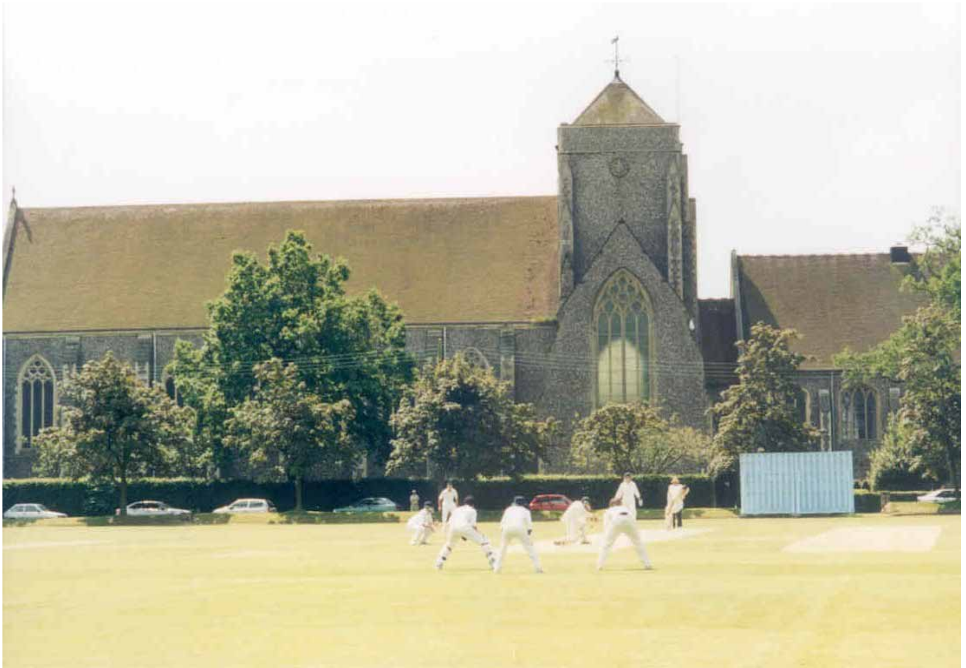
9 Hurstpierpoint College, Sussex 2