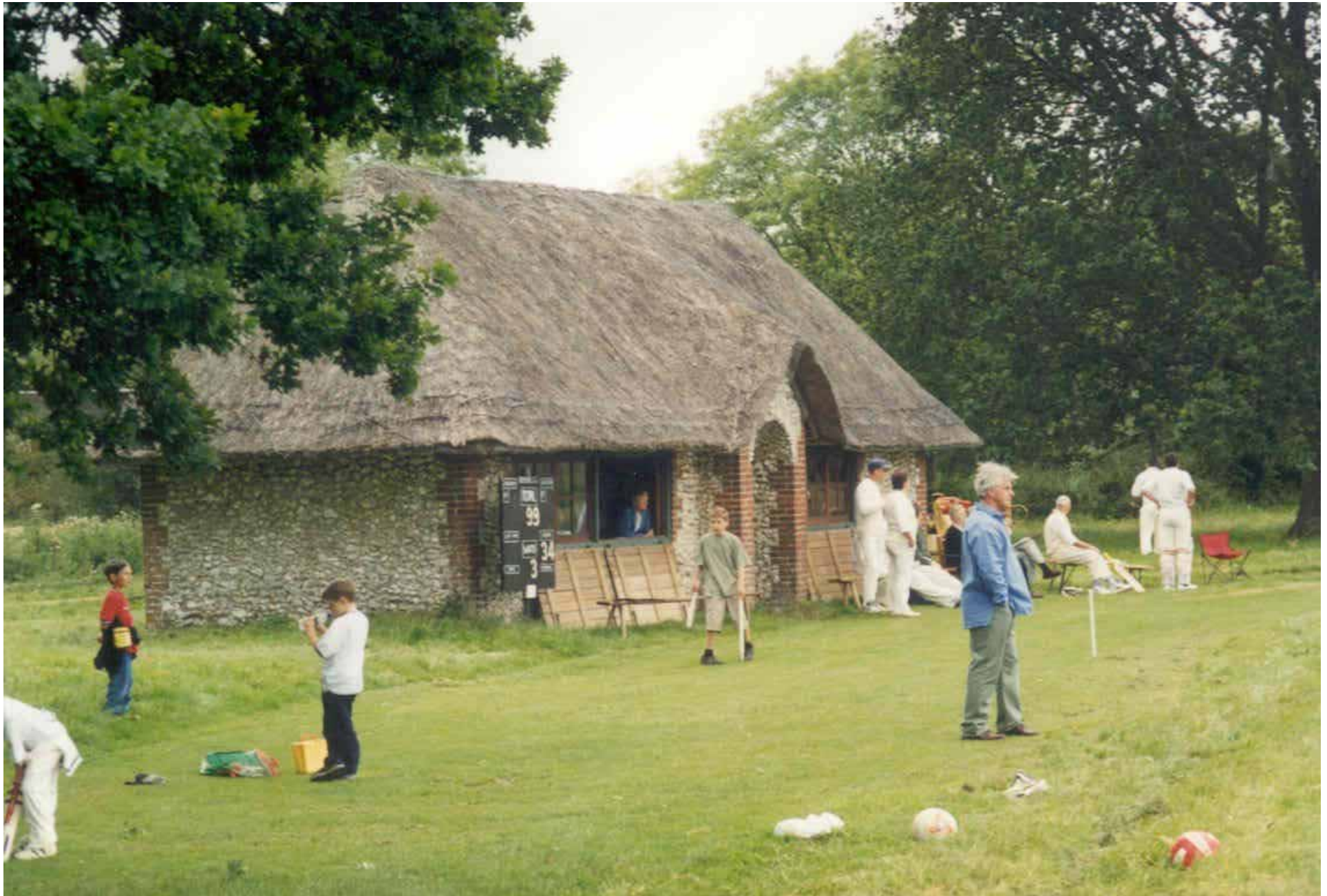
15 Breamore, Hampshire 2