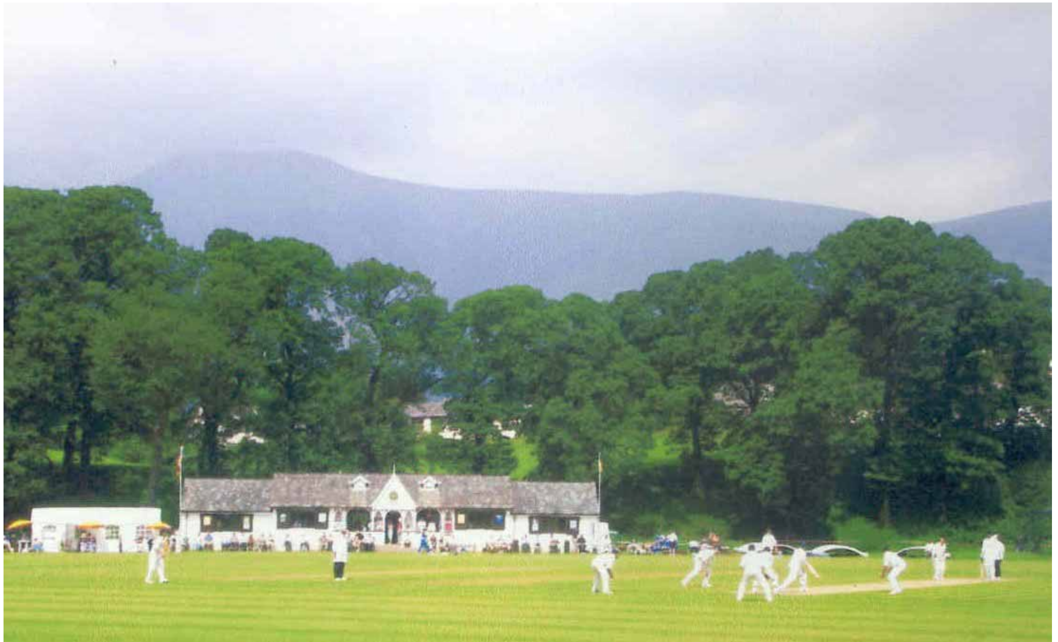
32 Keswick, Cumbria