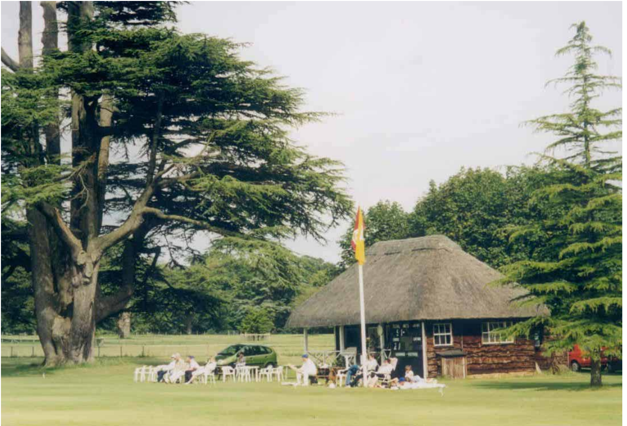
16 Goodwood Park, Sussex