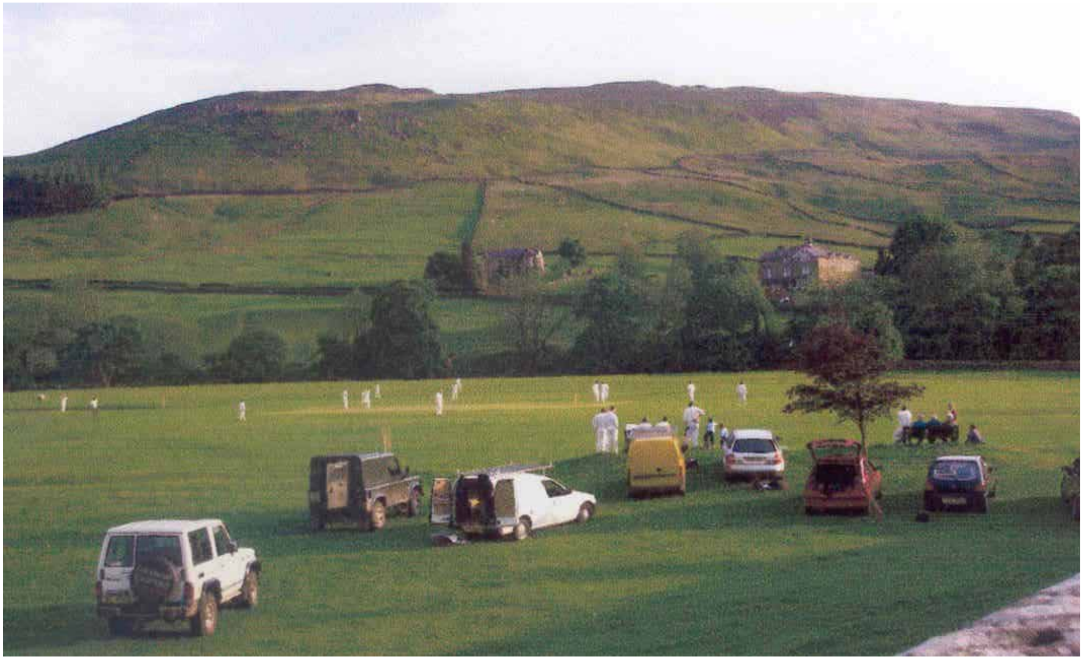
27 Burnsall, North Yorks 1