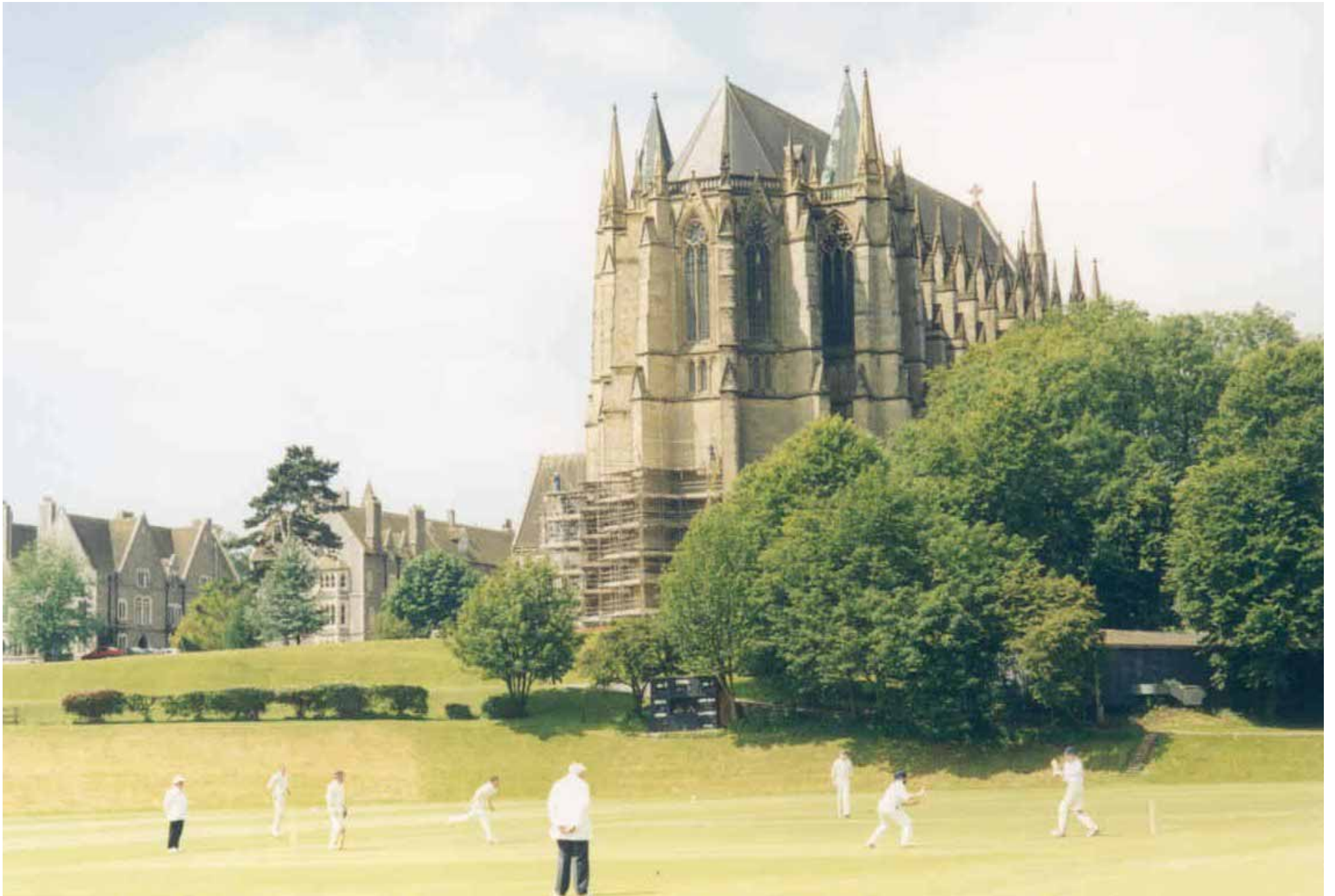
11 Lancing College, Sussex 1