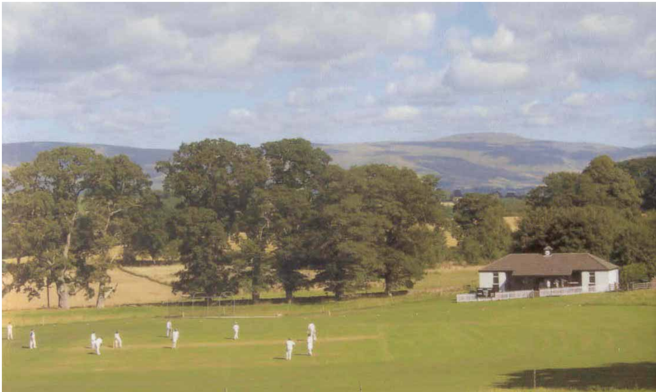
31 Nunwick Park, Cumbria