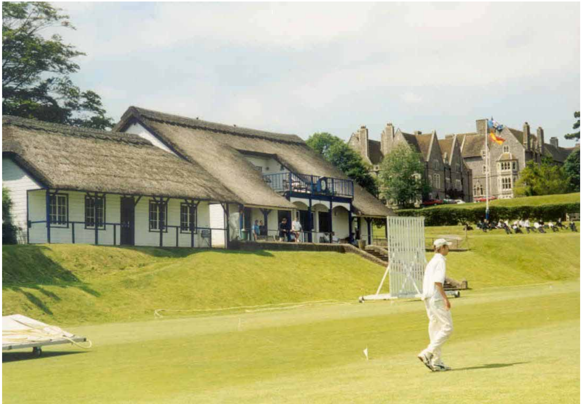
12 Lancing College, Sussex 2