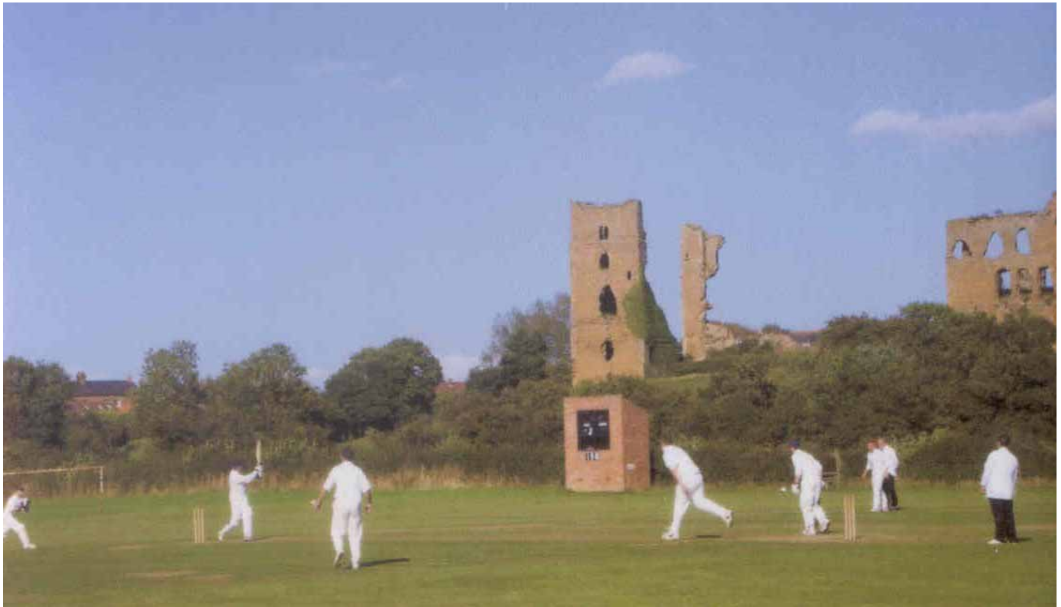
26 Escrick Park, North Yorks 2