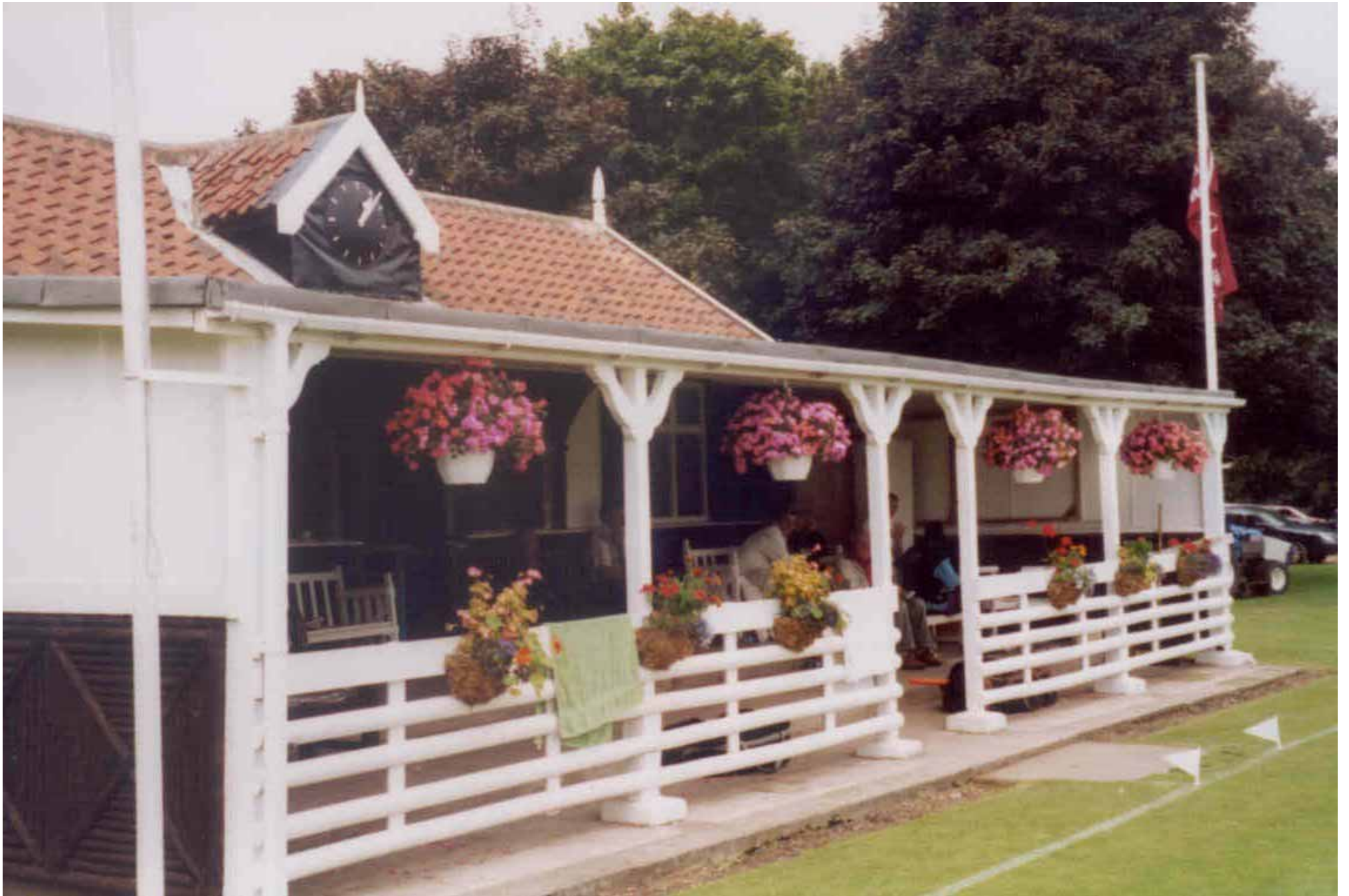
22 Worksop College, Notts