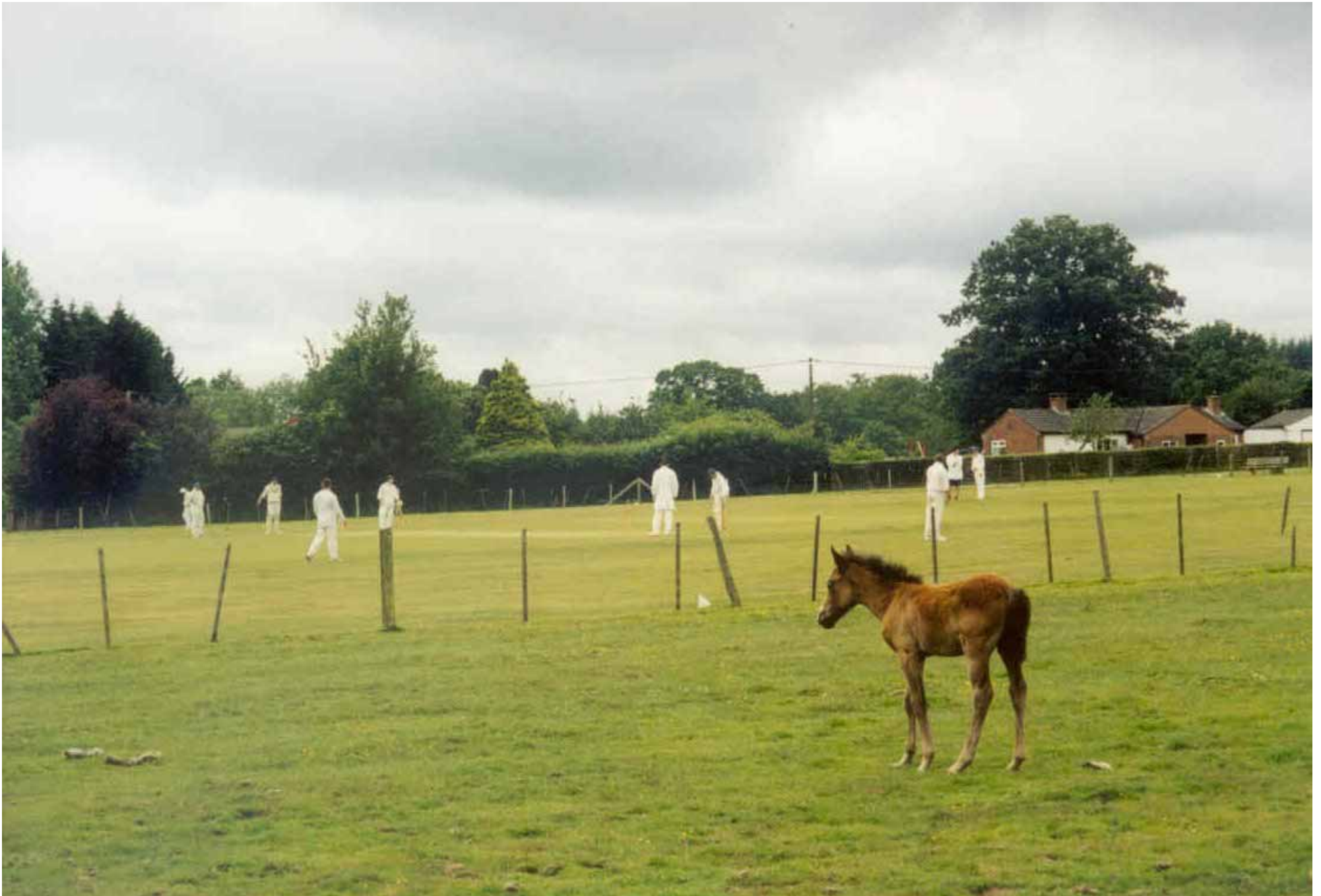
19 Minstead, Hampshire