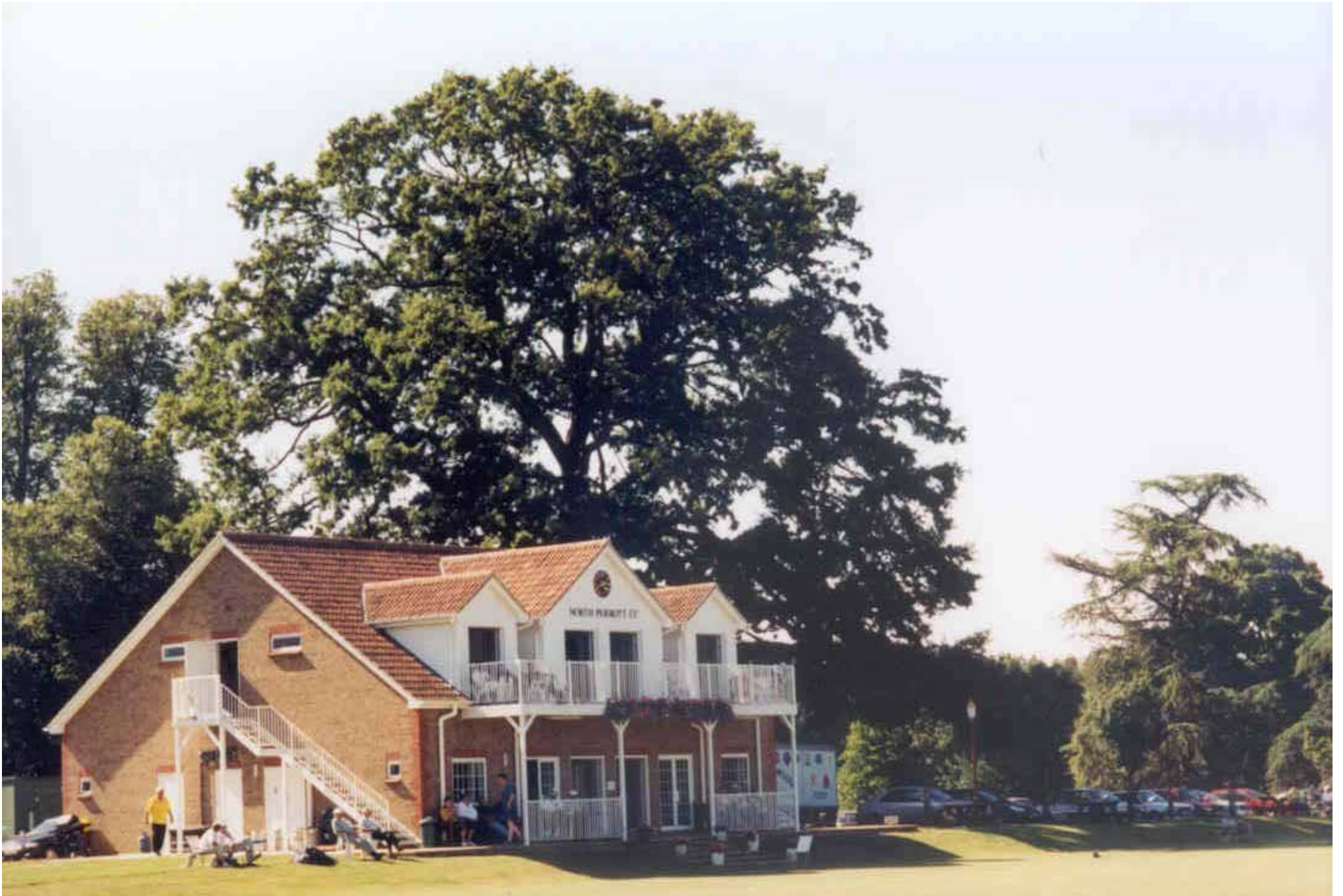
18 North Perrot, Somerset