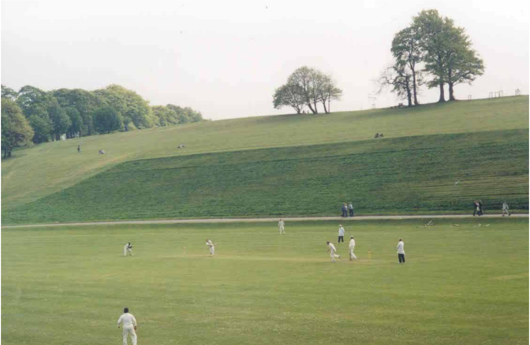
1 Roundhay Oval, Leeds