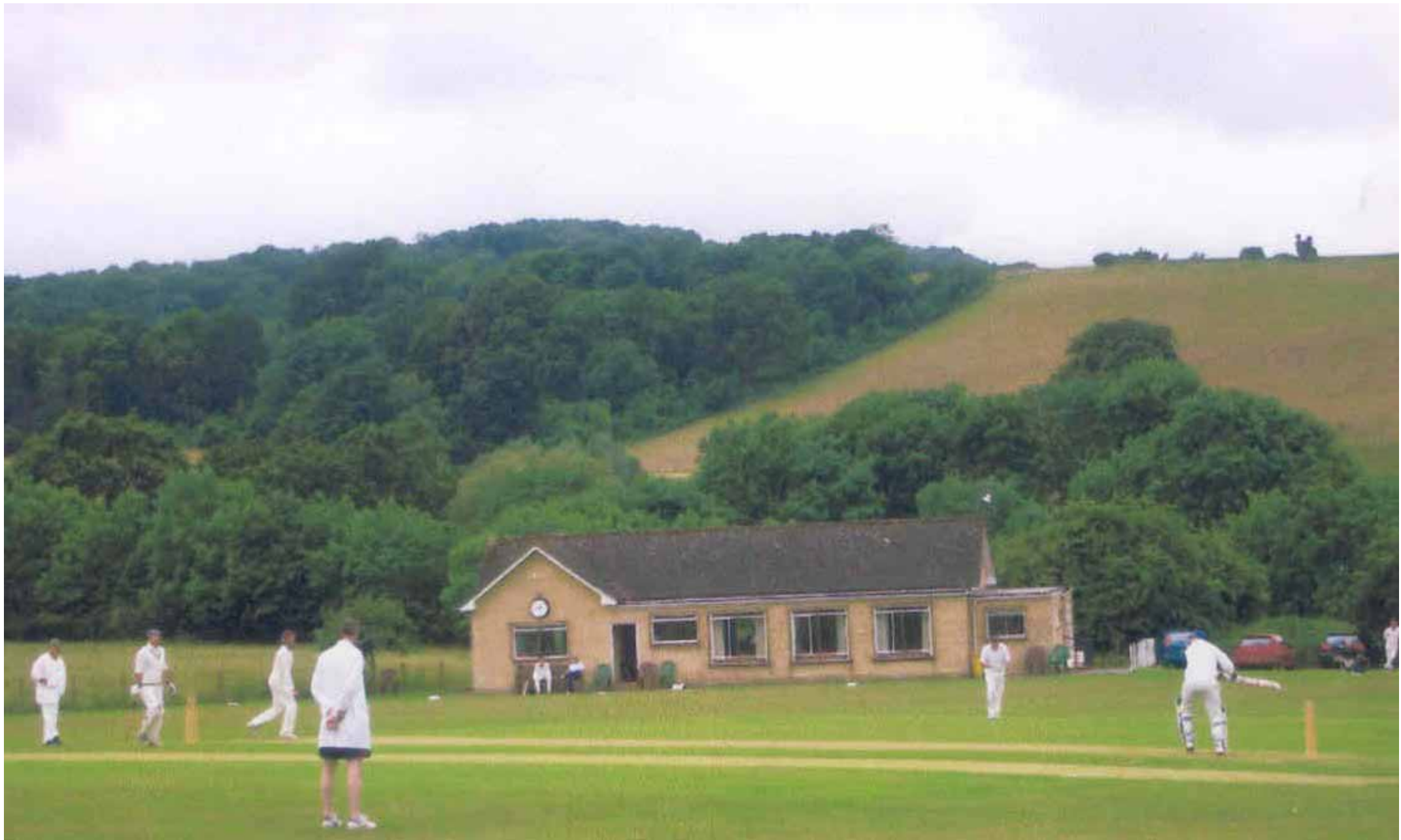
13 Broadway, Worcestershire