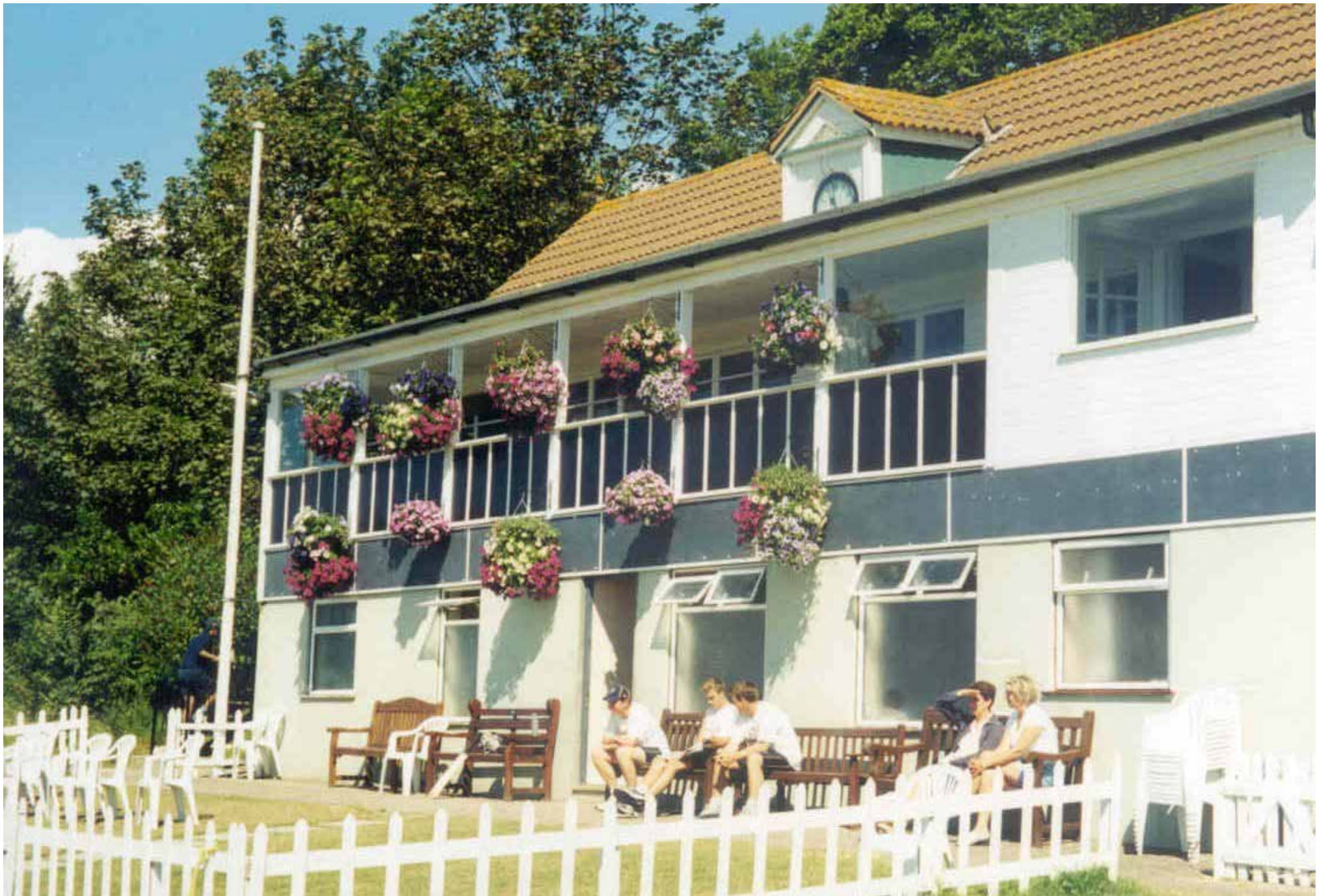
20 Exmouth, Devon