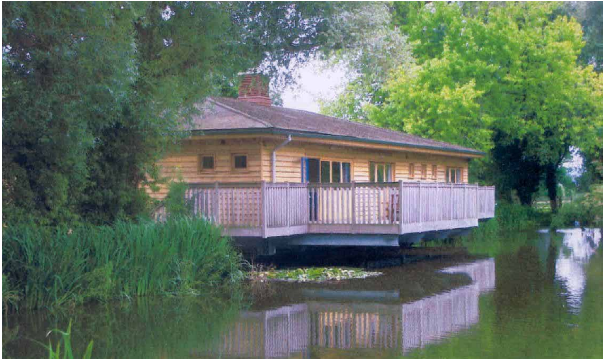
3 Dumbleton, Gloucs 1