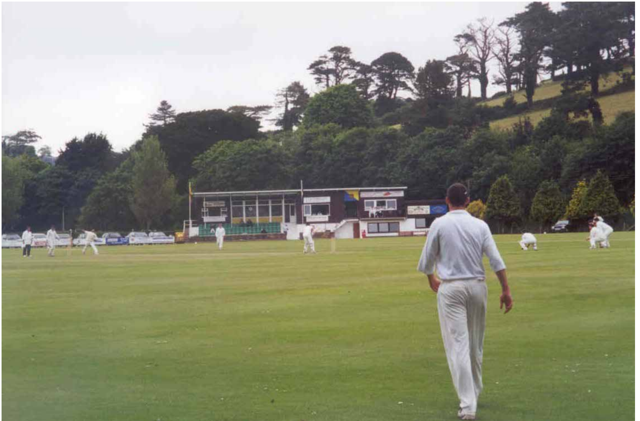
21 Truro, Cornwall