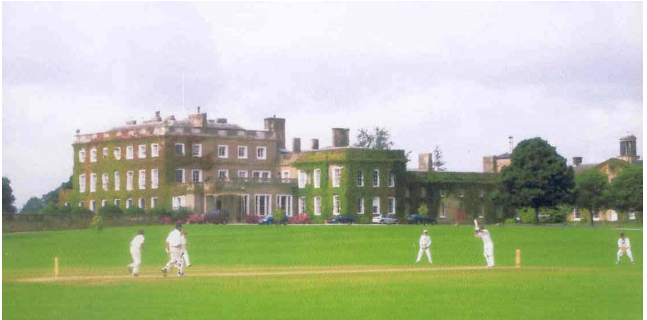
25 Escrick Park, North Yorks 1