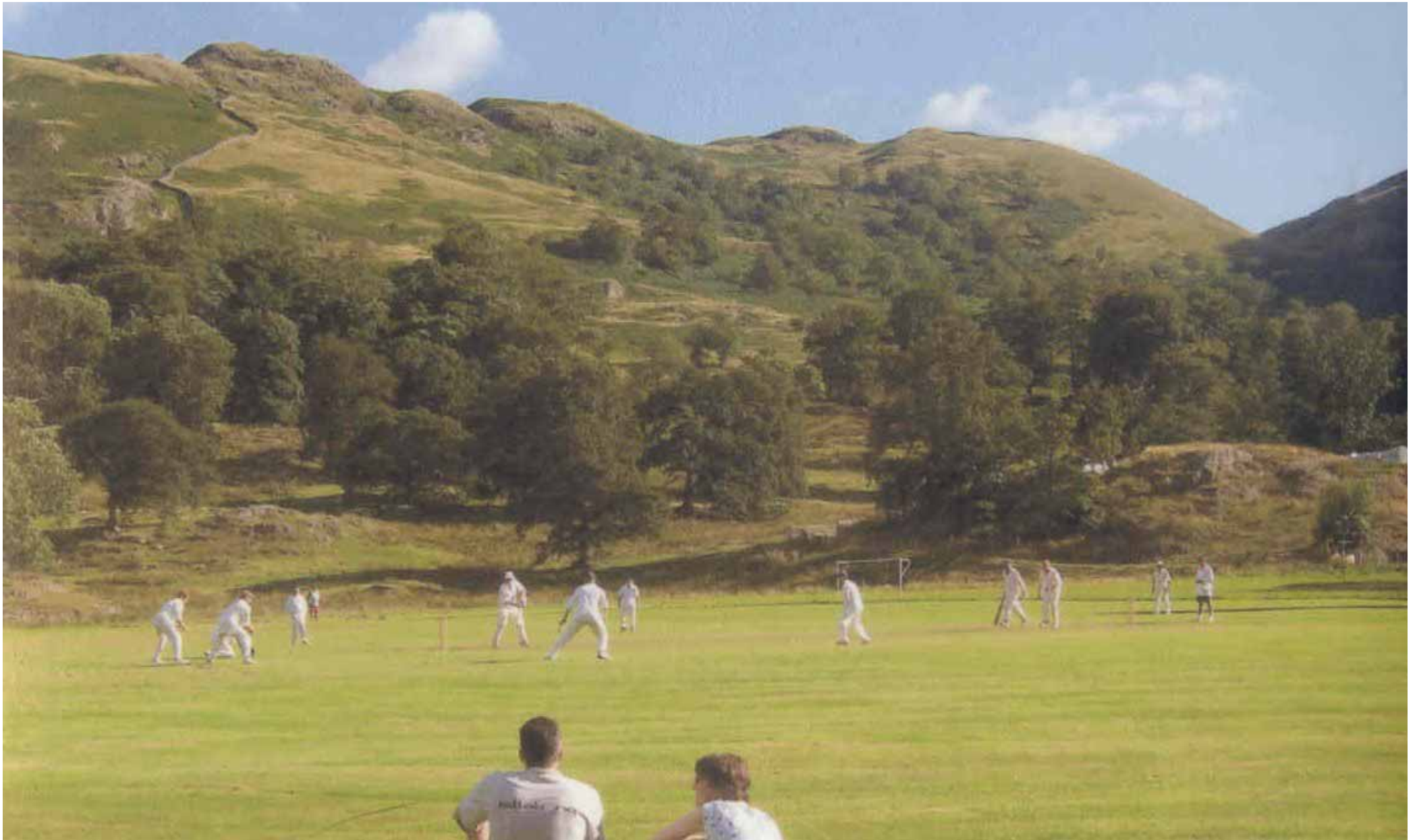
30 Patterdale, Cumbria