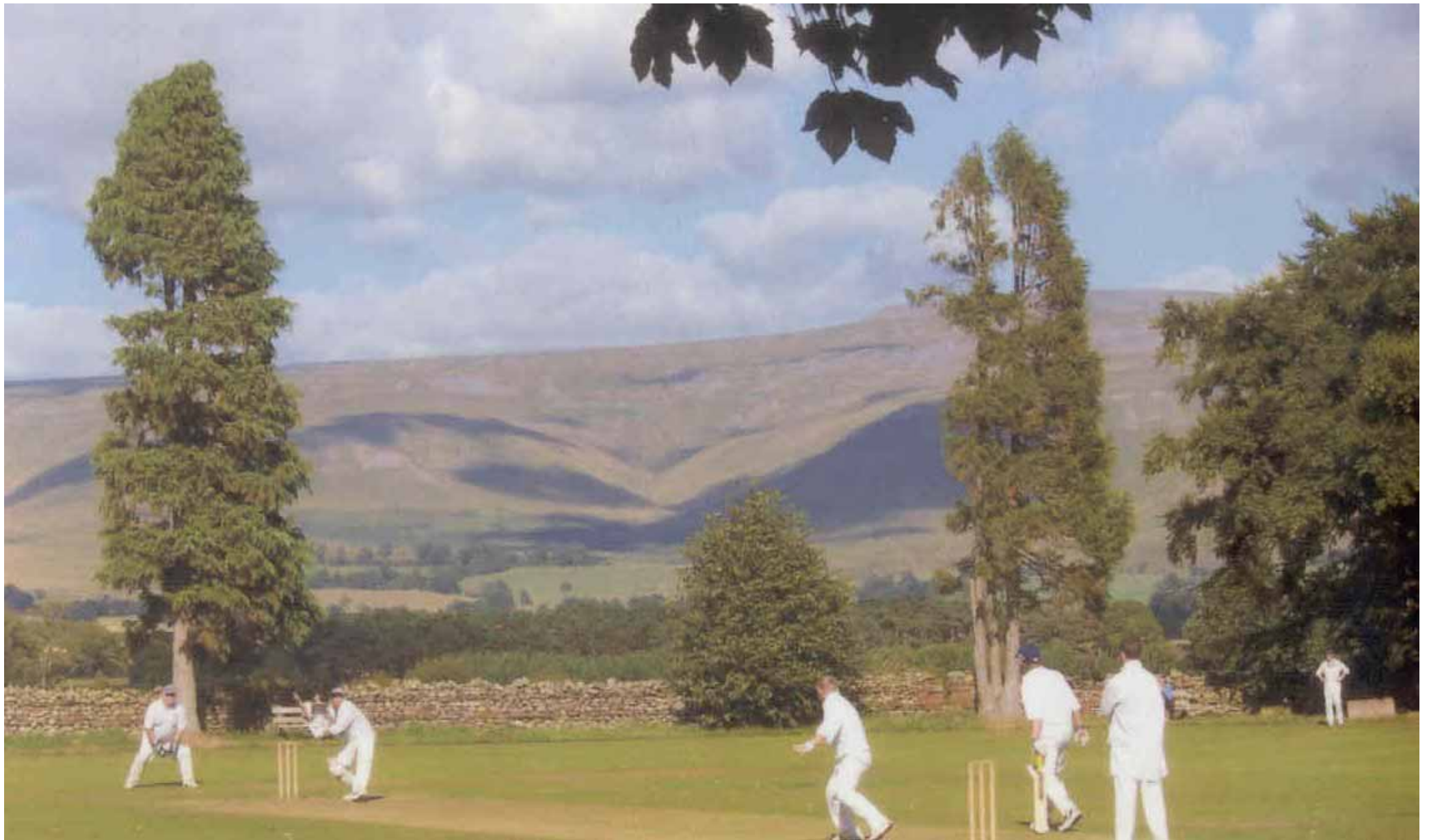
29 Culgaith, Cumbria