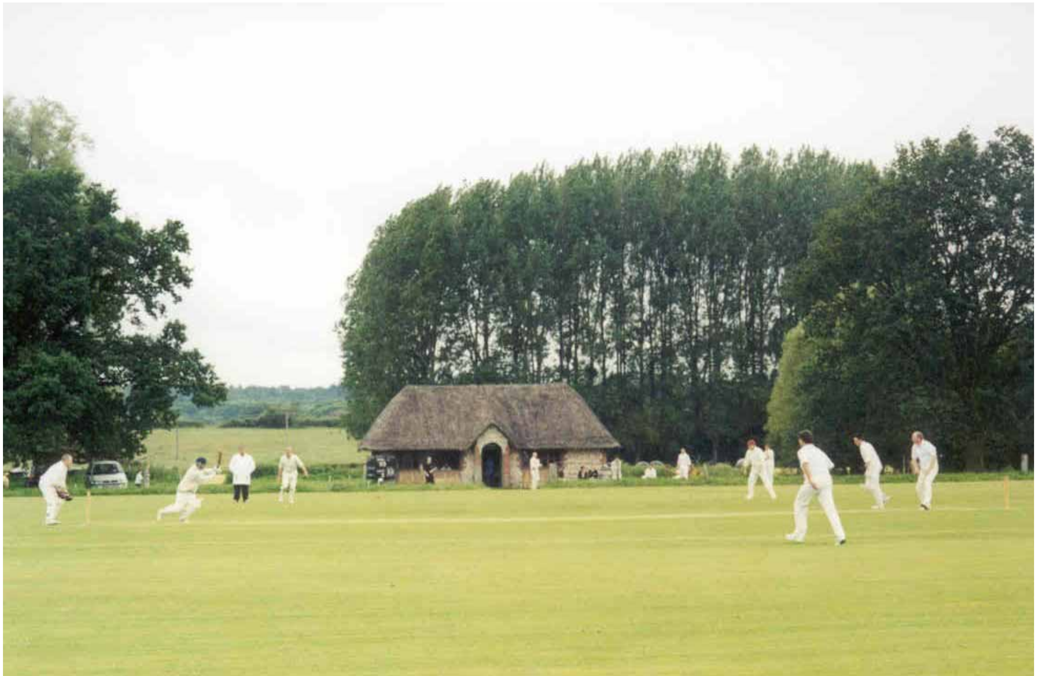
14 Breamore, Hampshire 1