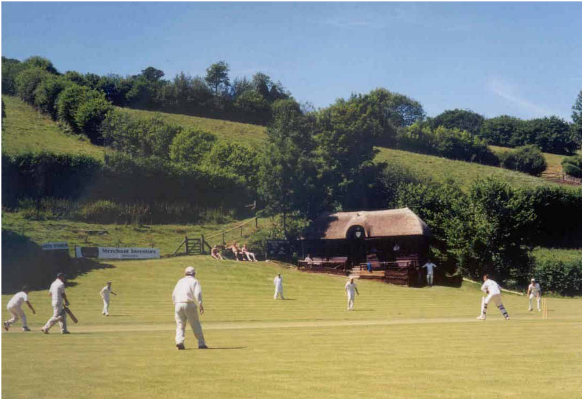
5 Bridgetown, Somerset