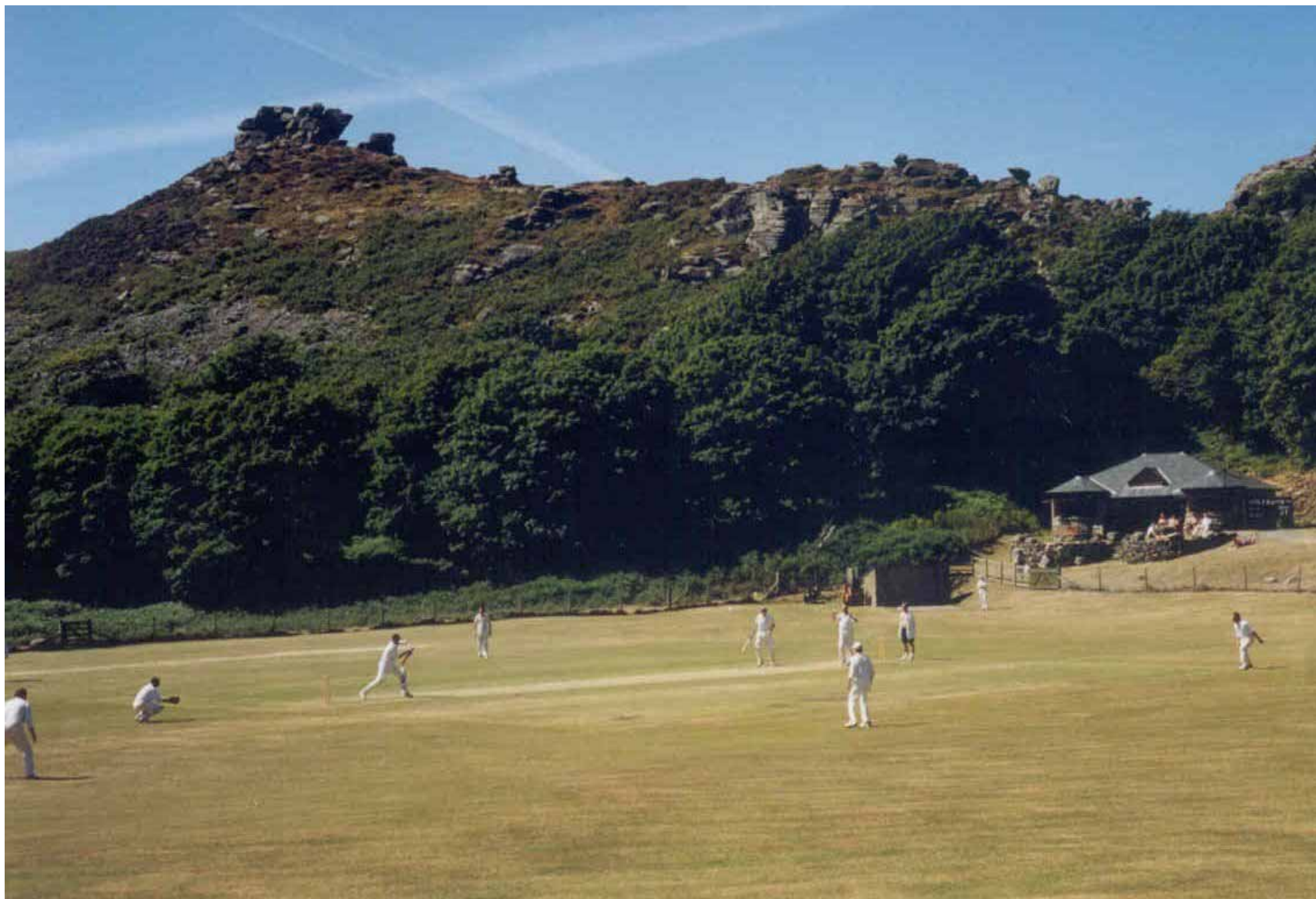
6 Lynton & Lynmouth, Devon 1