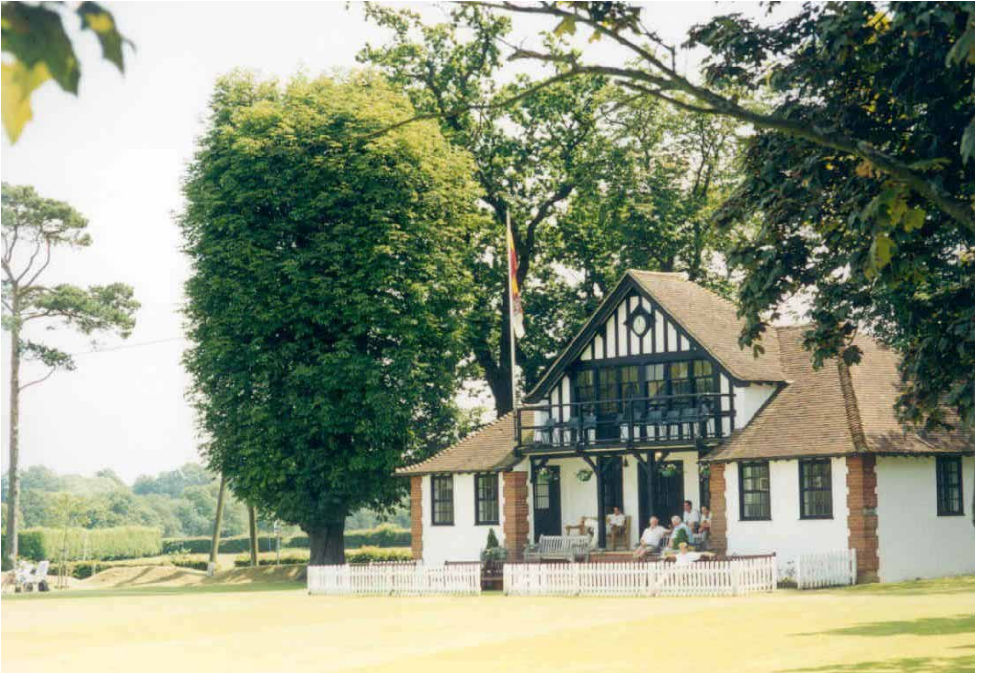
8 Hurstpierpoint College, Sussex 1