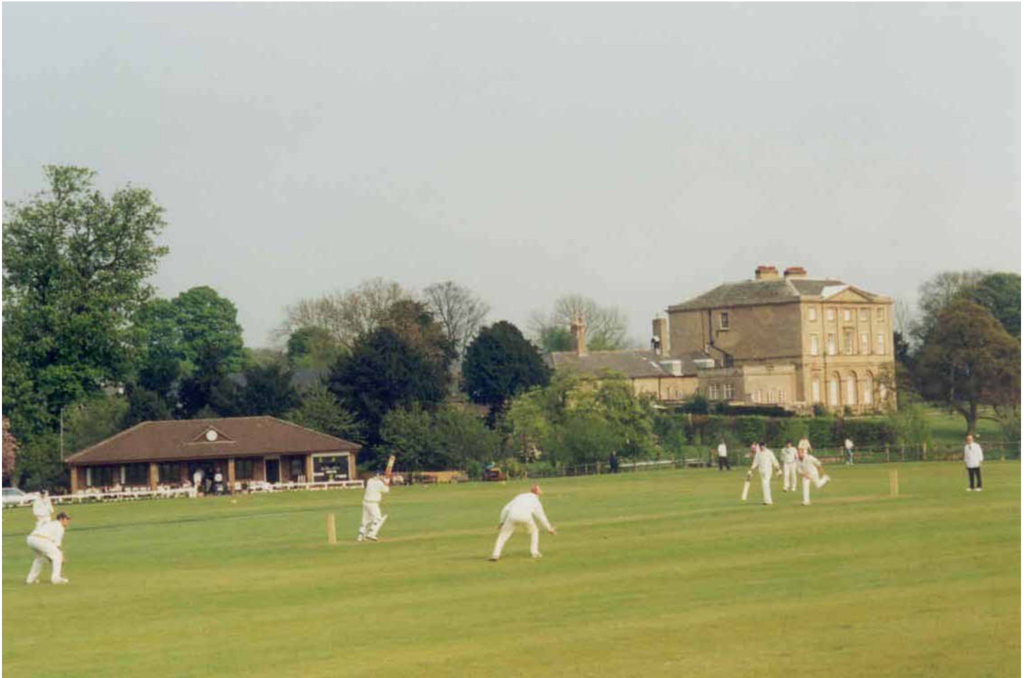
23 Papplewick & Linby, Notts