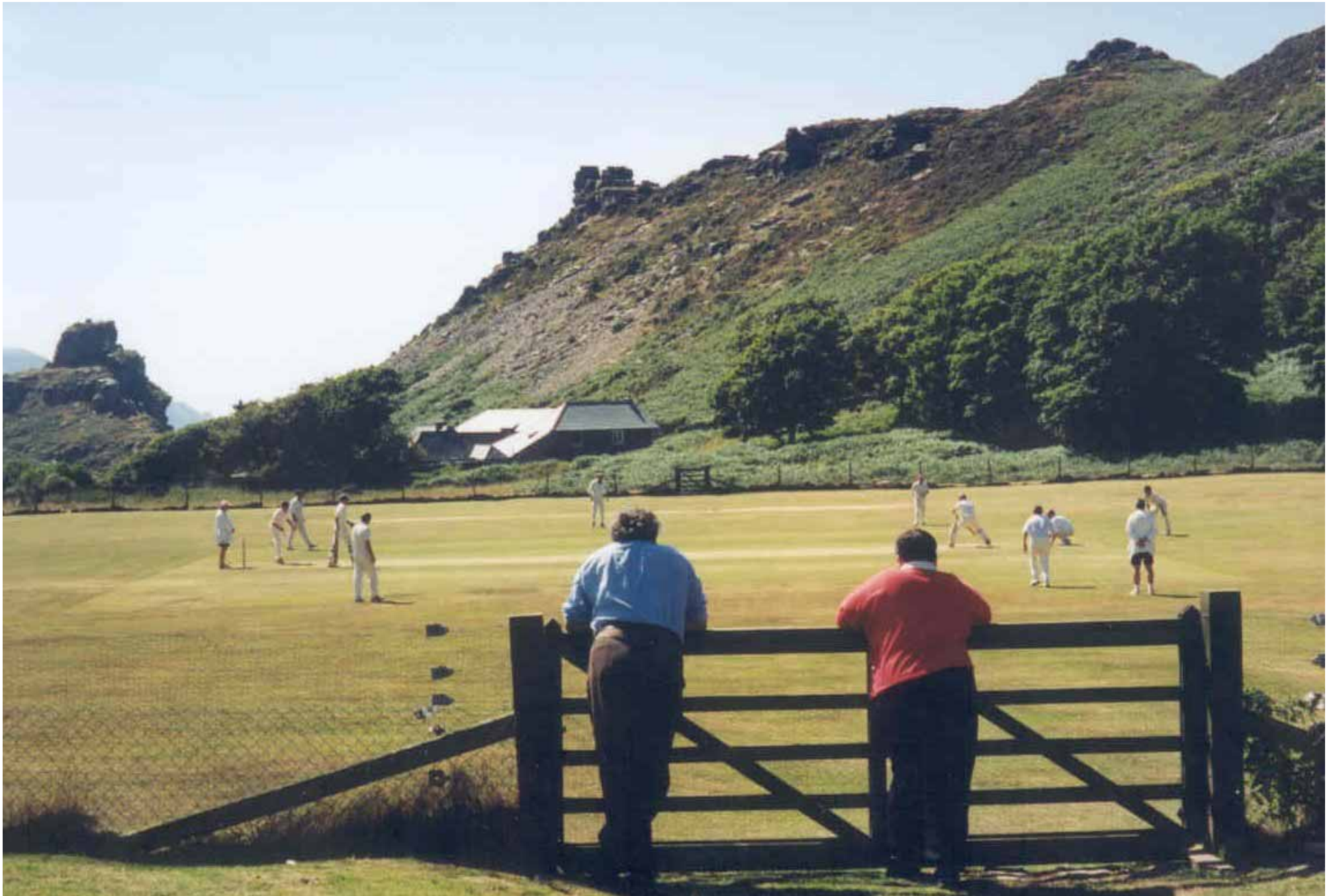
7 Lynton & Lynmouth, Devon 2