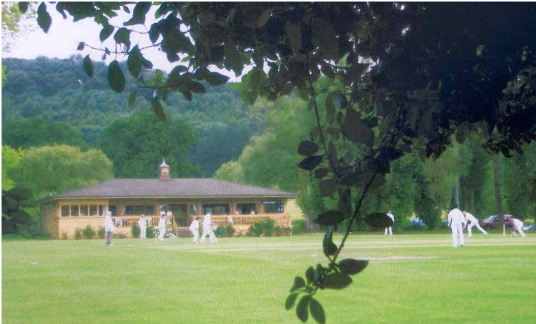
4 Dumbleton, Gloucs 2