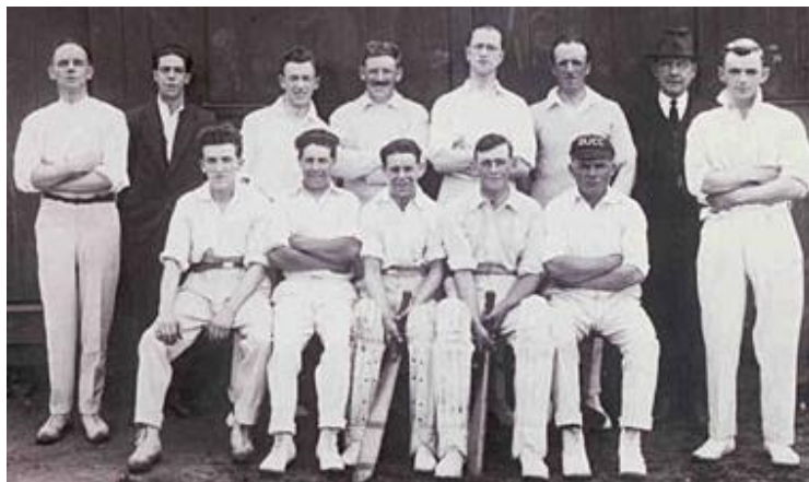
Denby CC, 1932

Climb over the stile and through a gate and you should now be standing in Denby Cricket Club's home ground. If one of Denby's teams are playing at home you might want to sit on one of the benches and take a short break.