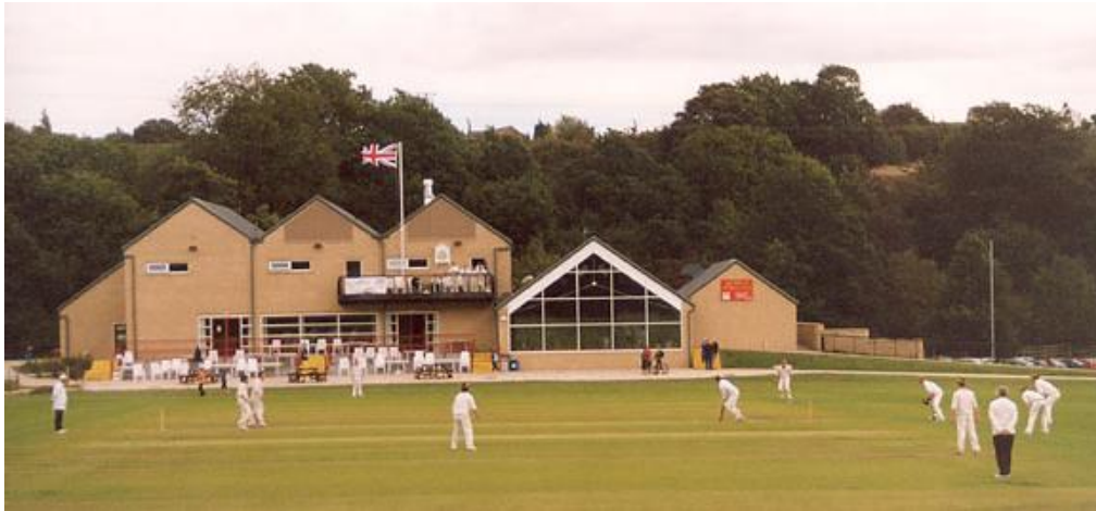
The new Brighouse CC ground

On your right, you should now see the new premises of Brighouse CC coming into view - Russell Way – complete with rugby pitch and state-of-the-art clubhouse facilities.