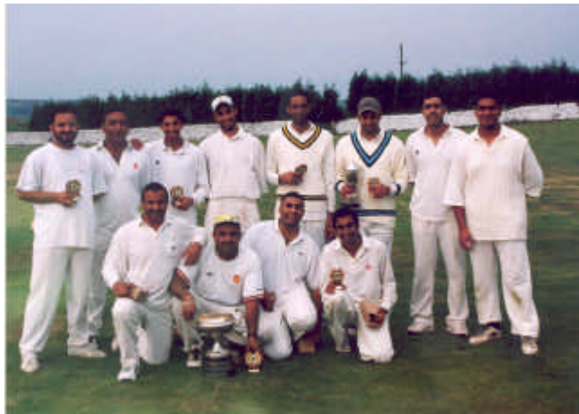
The mighty QRM

Hebden Bridge produced one of their performances of the season, just failing to deny Queen's Road Muslims the win they needed to claim the Halifax Association title.