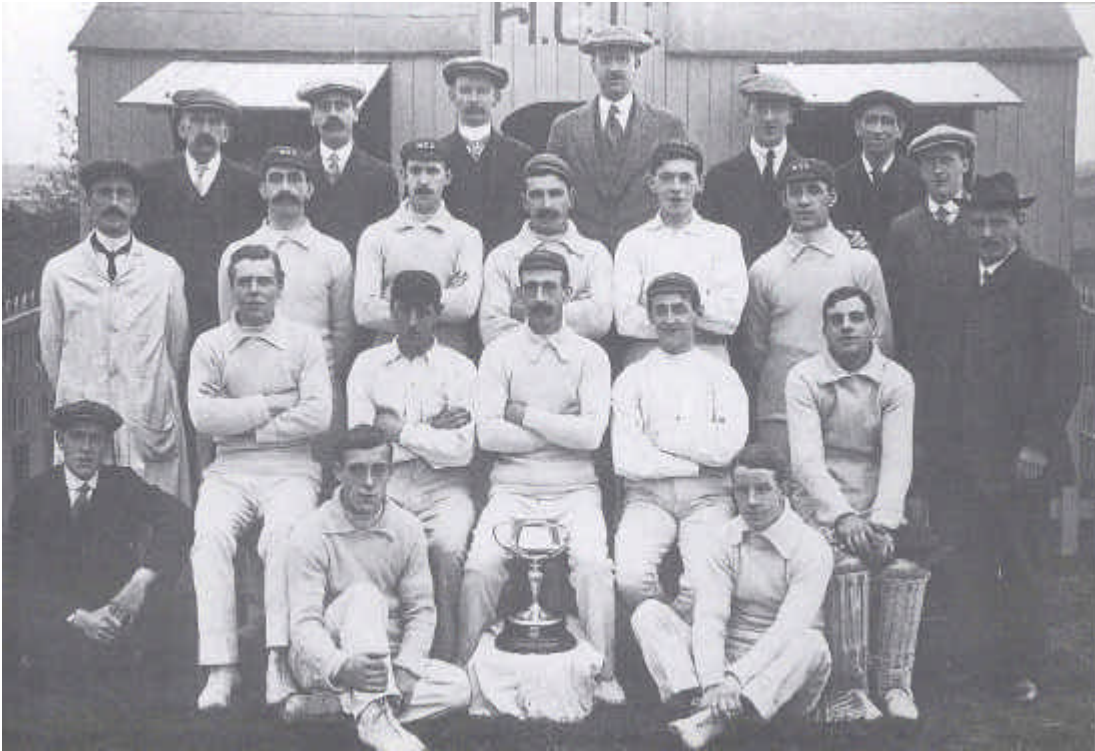
Healey CC, early 1920s