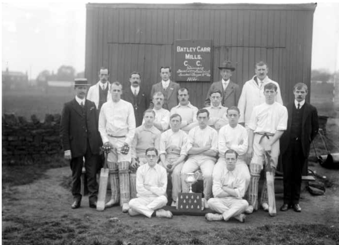
Dewsbury & District Division 2 Winners 1914