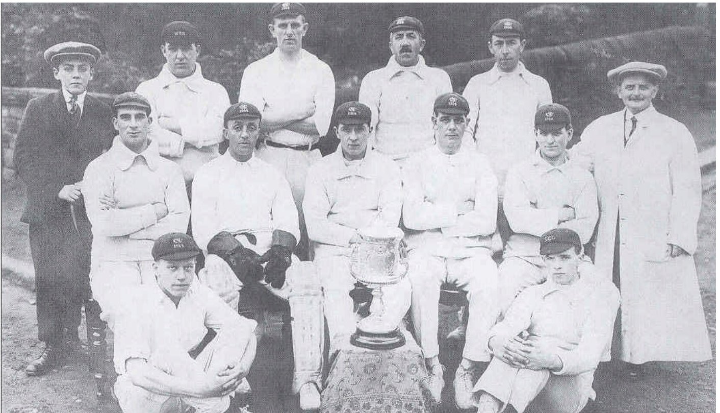
Soothill CC 1914